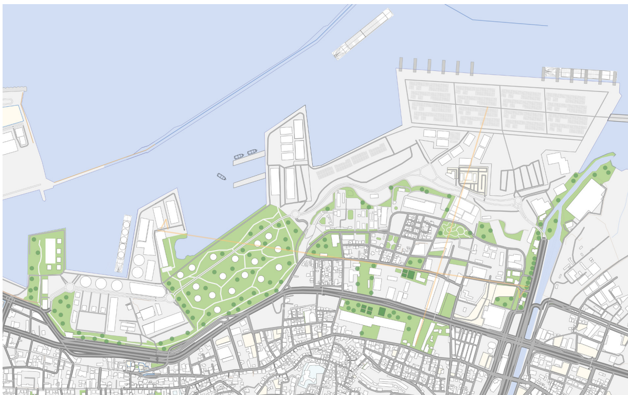
Fig. 2 Public and Healthy Port District (by Ghassan Mosto, Scott Spoon, Bram van den Berg, Kimberly van Vliet)