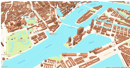
Figure 3: Visualisation of reconstructed LoD1.3 buildings

The LoD1.3 building reconstruction method uses the point cloud to find lines at the location of height jumps. These lines are used to subdivide the footprint polygon of the building into roofpart polygons. Each roofpart is assigned an elevation value equal to the 70 th percentile of the roofpoints it contains.