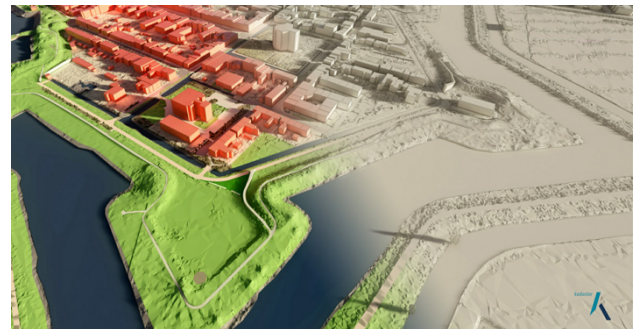
Figure 5: Visualisation of 3D Basisbestand Volledig as available from PDOK

The first product (BGT surfaces with LoD1.2 buildings) has recently been published via the governmental portal (PDOK-3D, 2020). See figure 5.