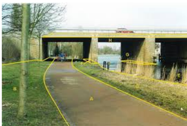
Figure 1: Relative height information as available in the BGT. The bridge (H) is at relative height level '1'. The bridge-parts F and G as well as the road, verge and water are at relative height level '0'. The latter form a planar partition (IMGeo, 2020)