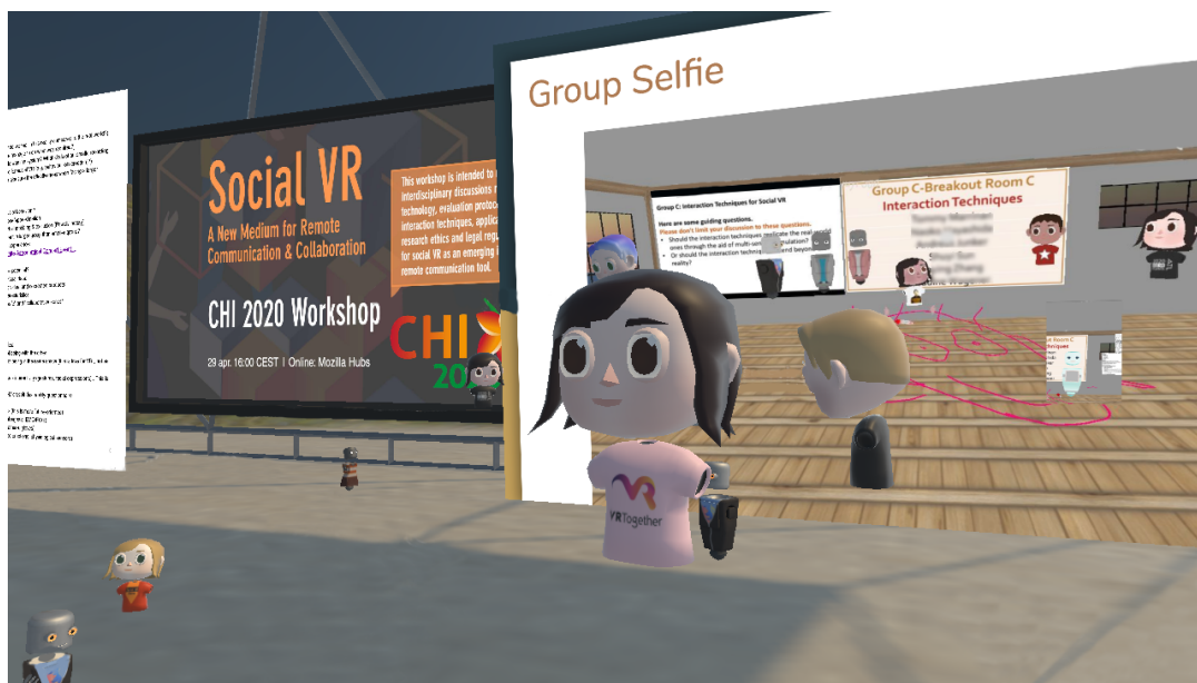
Figure 1: The CHI 2020 Social VR Workshop was hosted virtually on Mozilla Hubs.