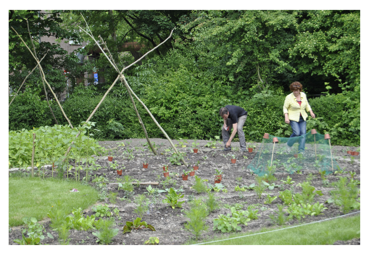
Fig. 3 Urban agriculture initiative in Rotterdam city (Photo: authors, June 2013)

research outputs about climate adaptation and mitigation as well as considering environmental quality improvements. There is a plethora of plans about climate change adaptation (e.g., floating pavilion, Fig. 4), urban green planning (e.g., restoring green riparian areas), restoration of neighborhood areas into more welcoming and green spaces (e.g., placing trees and green lawns on top of sealed squares), as well as a sustainability agenda and monitoring scheme of the city and its districts. Ongoing plans and strategies are disconnected and synergies between activities and in situ plans are neither addressed nor exploited. The reason is voiced to be the lack of information sharing between the different departmental teams within the city administration that further hinders coordination.