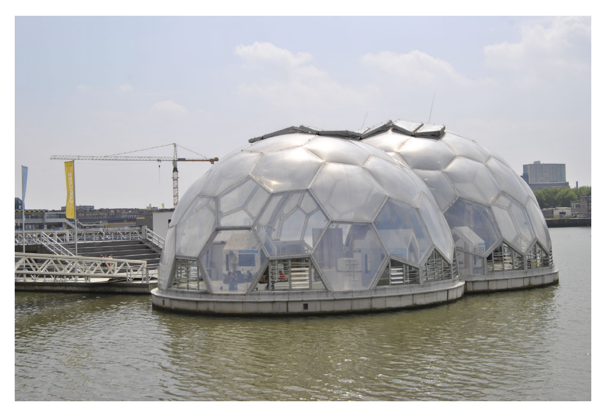
Fig. 4 Floating pavilion in Rotterdam's city ports. An experiment of floating urbanization (Photo: Authors, June 2013)

citizens and as such have less social value. At the same time, the locations with great social potential if restored into green areas do not yield water retention benefits due to their location. As such, there are few locations that these two objectives can meet (e.g., using green space as a water retention area) with the majority of small-scale locations to be competition spaces for implementing climate adaptation measures or urban sustainability measures (e.g., multifunctional spaces to meet multiple socio-ecological needs).