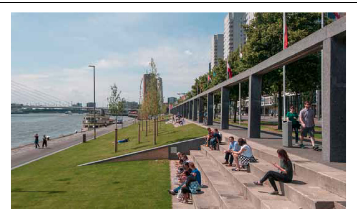
Fig. 2 View of Boomjeskade in Rotterdam. The impermeable pavement of the riverbank was replaced with grass creating a soft infrastructure for flood buffering that at the same time serves as a green space for people to use.

visions can directly relate to improving the city via specific projects. With this tendency to focus on action, there is a risk of losing the trail from the vision to the action when there are no trail keepers in the city's planning process that remain to their position on the long term. The different projects that bring to life the visions that have been formulated have a project-management horizon. As thus, it is often the case that there is limited ownership of some of these projects due to project teams assembled on project basis. This results in diminishing knowledge on how each project relates to the overall vision for the city.