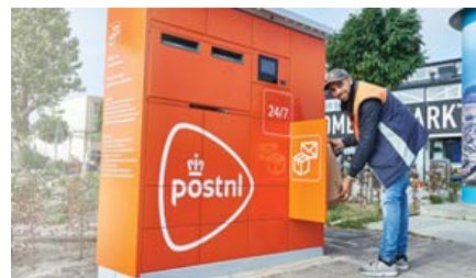
Fig. 2. Example of a Parcel locker

As can be seen in Table 2 the only thing that differs is the height of the lockers; the width and length are exactly the same. The current overall dimensions of the complete parcel locker are, 1610mm x 525mm x 1758mm. The parcel machine has a touchscreen and can be used to draw signatures. A camera is mounted in the locker as well for safety reasons and the machine is reasonably vandal proof. Consumers will receive an email/text when the parcel has arrived in the locker. The machine has a scanner as well, to be able to scan ID's when needed. The maximum storage in this machine is 3 days, where after the parcel will be transported to a nearby retail location.