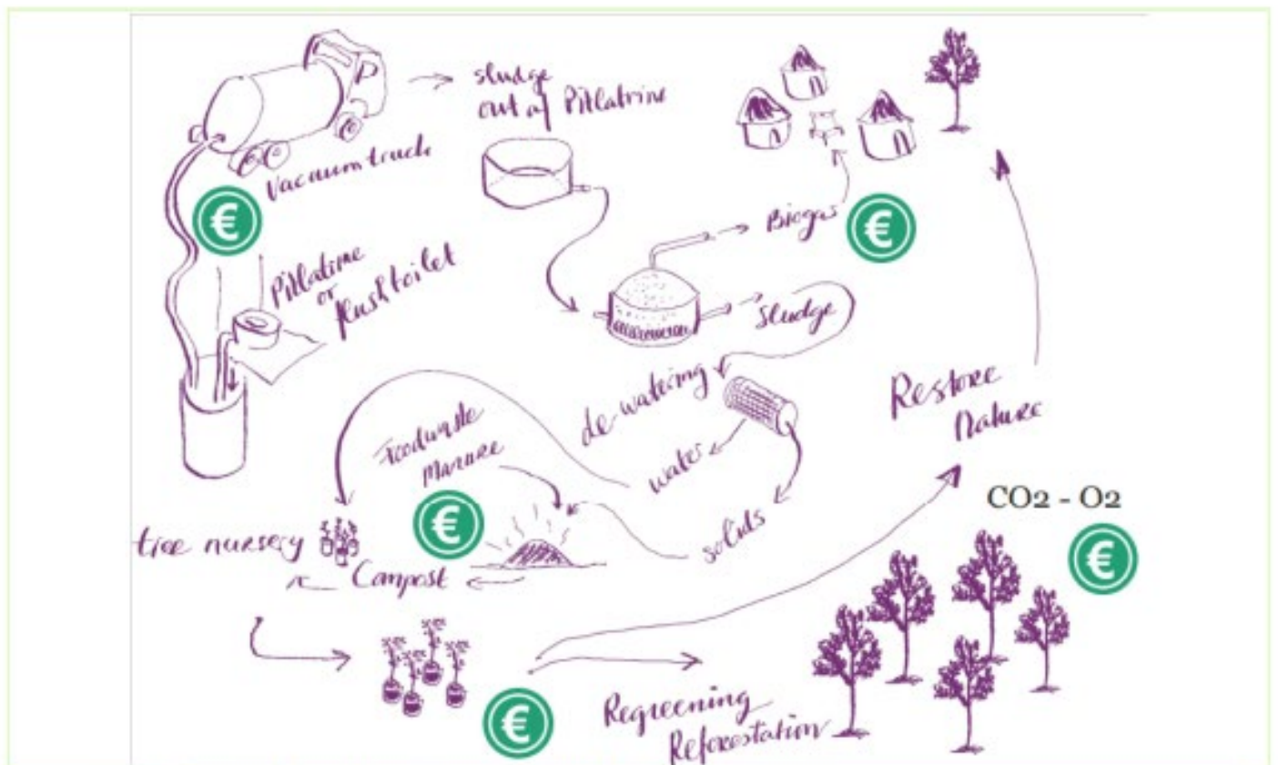
image / figure 2 Current infographic on the working of the Bio-Digester in context