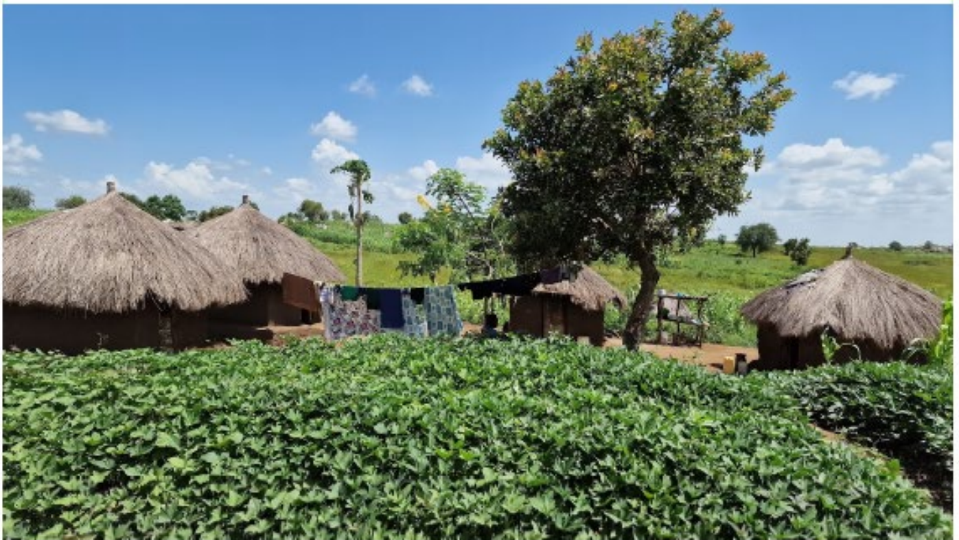
image / figure 1 The Imvepi Refugee Settlement in Terego District, North-West Uganda