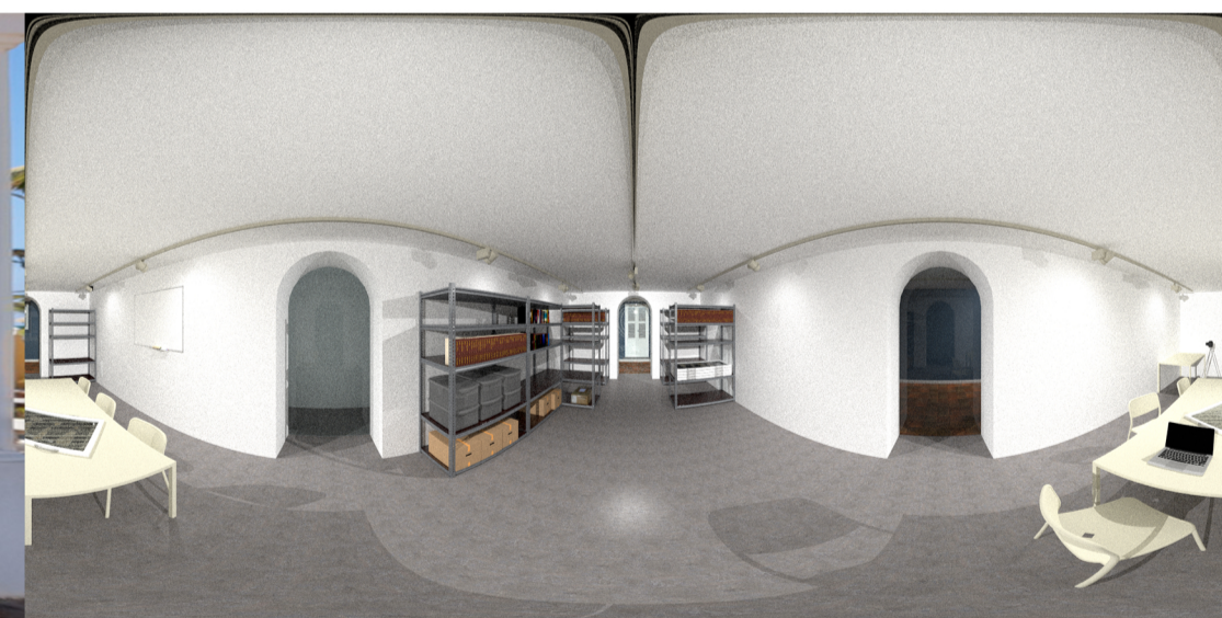
Research & Work Space