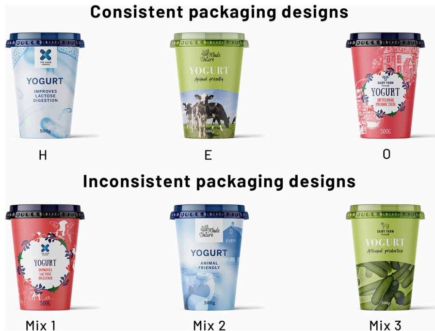
Fig. 4. Consistent and inconsistent designs for the yogurt.

typeface was used -, the pictorial style of the image (e.g., a drawing or a photo), the size and shape of decorative elements, and the choice of color. Each of these elements are discussed in more detail below. Often the choices of these stylistic elements were based on how certain elements were used in comparable product packages currently available in the market.