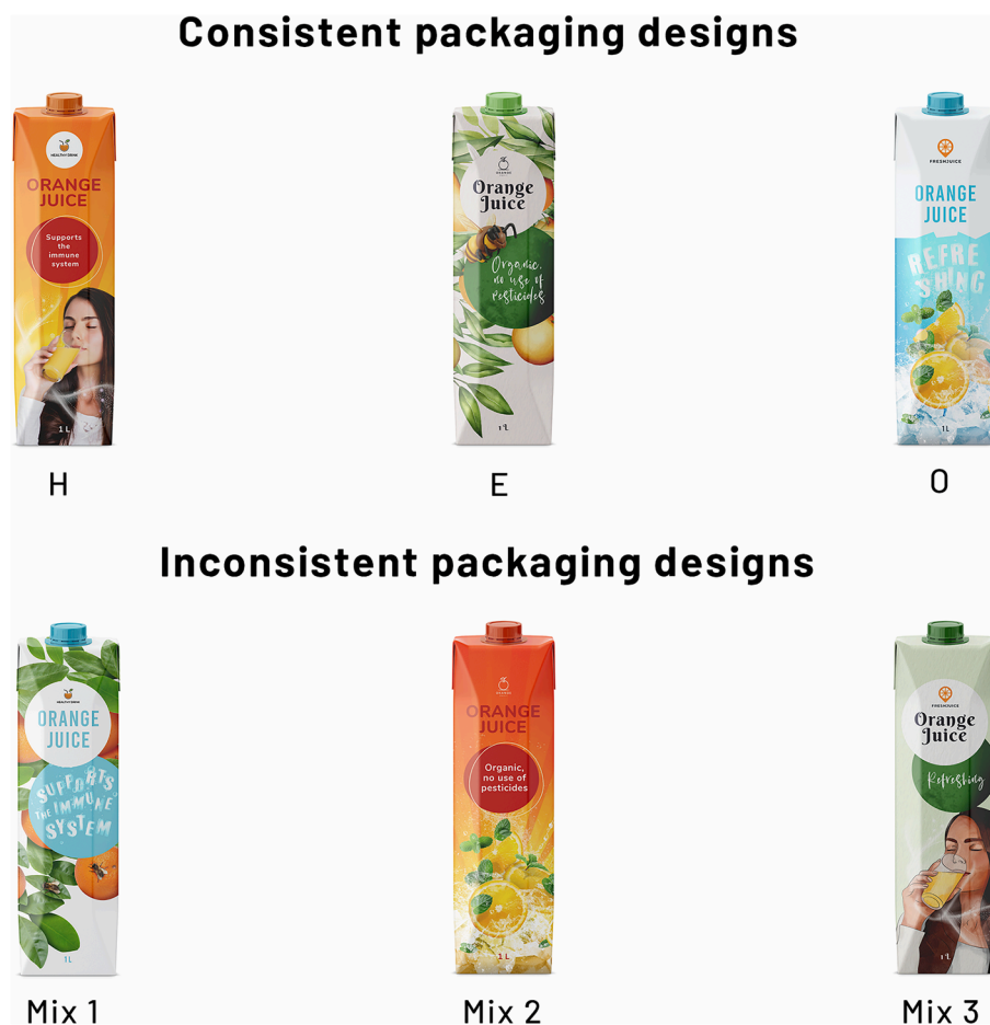
Fig. 2. Consistent and inconsistent designs for the orange juice. (For full color images, the reader is referred to the web version of this article.)