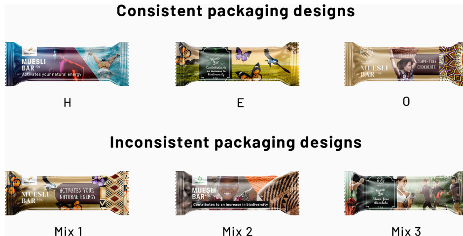
Fig. 3. Consistent and inconsistent designs for the muesli bar.