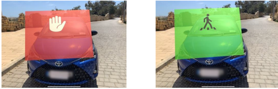
Figure 3: Concept 2. Left : non-yielding state with the red plane and hand icon augmented on the vehicle. Right : yielding state with the green plane and crossing figure icon augmented on the vehicle.