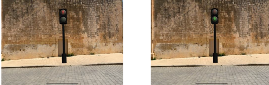
Figure 5: Concept 5. Left : non-yielding state with red pedestrian icon. Right : yielding state with green pedestrian icon.

field extends beyond the crossing point, whereas for the yielding state, the field switches to green, widens, and terminates prior to the point of crossing to emphasize the vehicle will not cross beyond this point.