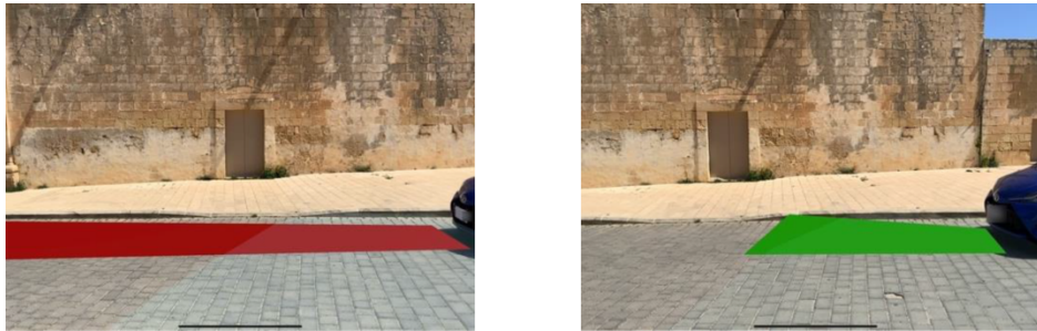
Figure 4: Concept 4. Left : non-yielding state with the red field of safe travel extending over the crossing area. Right : yielding state with the green field of travel shortened and truncating before the crossing area.