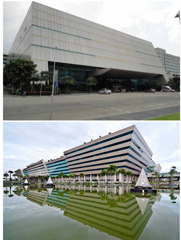
Figure 3. The Dhanarak Asset Development building (A) and The Bangkok Government Complex (B)

shows the exterior of the building, whereas figure 4 shows two interior spaces of the Government Complex buildings.