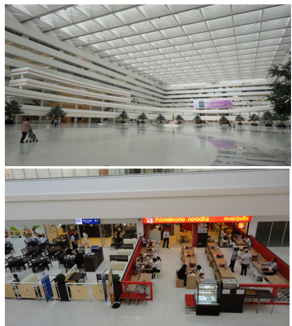
Figure 4. Main hall of the Government Complex buildings (A) and the commercially rented area (B)