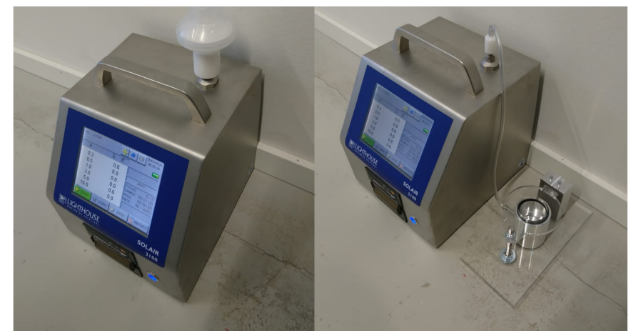
Figure 2, Filter testing setup. Left, adapter made to test respiratory filter for ventilation. Right, adapter made for connection of the particle chamber.