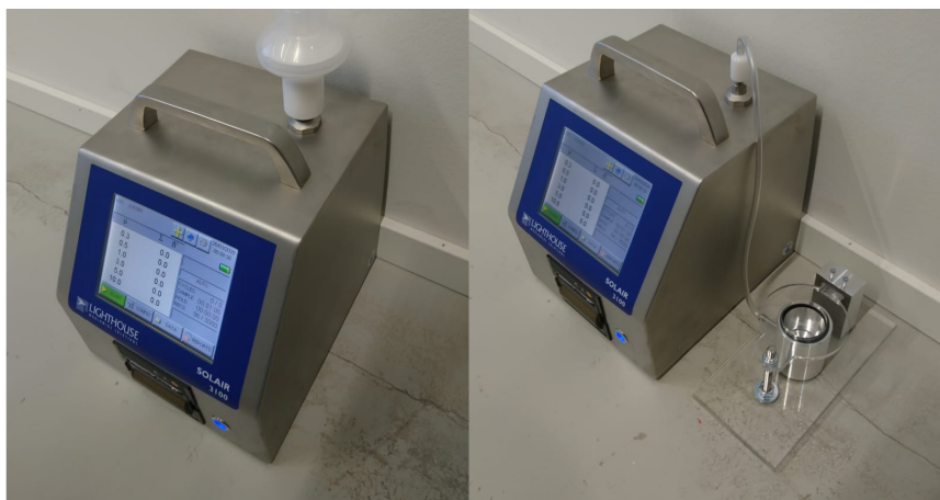
Figure 2, Filter testing setup. Left, adapter made to test respiratory filter for ventilation. Right, adapter made for connection of the particle chamber.