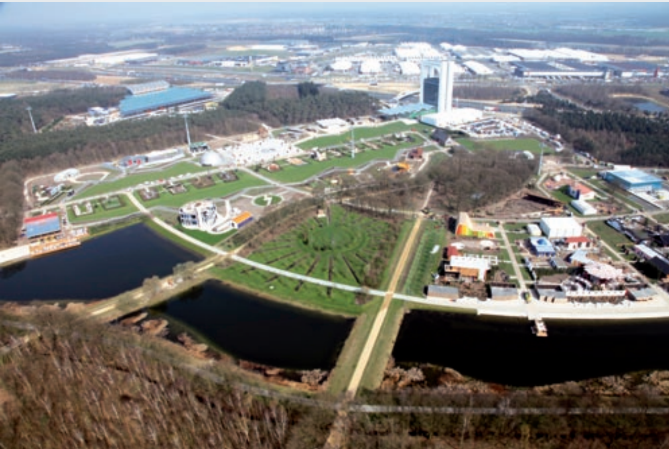
LEFT An aerial view of the park shows, from left along the water's edge, the Beachclub restaurant, Rabo Earthwalk, Vriendenbos and World Show Stage. BELOW xxxxxx xxxxxx xxxxxxx xxxxxxxx xxxxxxx xxxxxxxx xxxxxxx xxxxxxxx