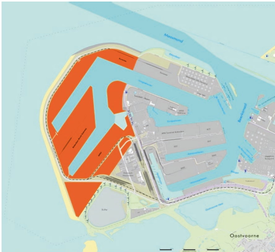
Fig. 2 Overview of the Maasvlakte 2 project in the port of Rotterdam.

The Second Maasvlakte (MV2) has been financed primarily by the Port of Rotterdam Authority. The port authority borrowed money from the European Investment Bank (€900 million), the Bank Nederlandse Gemeenten (€450 million), and a bank consortium consisting of ING, Fortis, and Rabobank for a loan of €450 million. The total loan is meant to finance the MV2 and the infrastructure in the Port of Rotterdam. The consortium PUMA, composed of the companies Boskalis and Van Oord, has built the first phase of MV2. The companies VolkerWessels and BAM have been responsible for building the quays, railways, and roads. The project's main aim was to reclaim land from the sea and to build an additional port area that will be primarily used to accommodate new container terminals. In September 2008, after years of discussions, planning, and protests, the building of the MV2 started (the orange part in Fig. 2) and was finished after approximately 5 years, in May 2013, for a