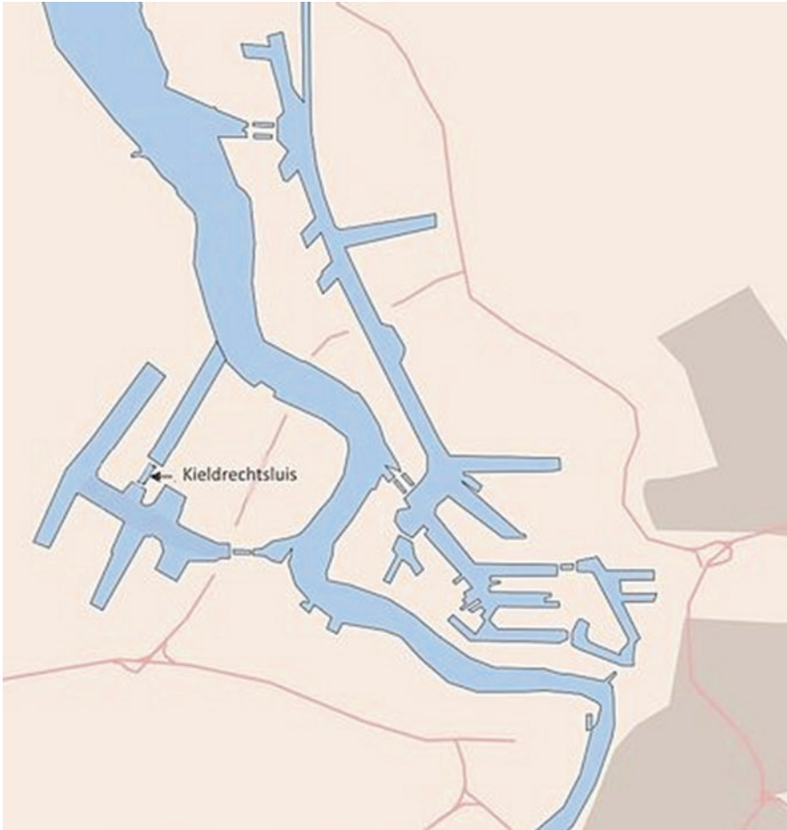
Fig. 3 Overview of the location of the Kieldrechtsluis.