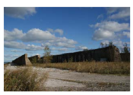
Condition of Ore Walls