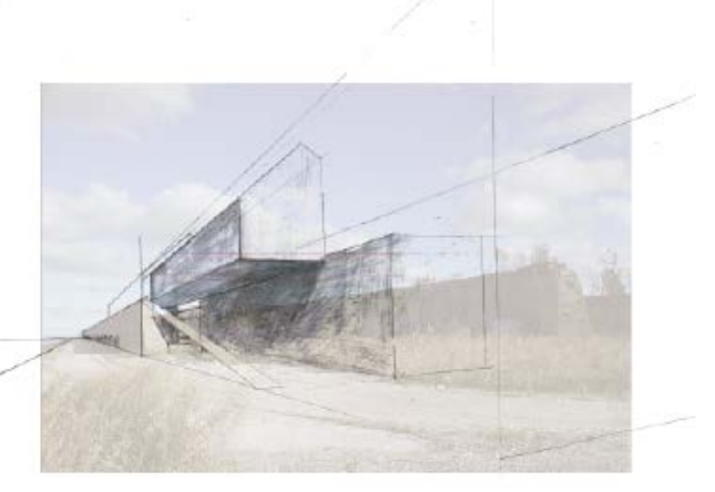
Imagination of Ore Walls

The existing walls form a special interesting boundary for people to experience the old memory of the industry factory. In order to create a new complete space, a new roof will cover the existing space. The old and the new facade form a contrastive interior space and they will act as a container of new functions. Different function blocks are filled into the space between the walls, not interrupting the complete waterfront space and the urban farming park. These blocks form a box in box feeling to make the new function distinguished from the boundary. Some blocks will extend out of the wall to tell people something is happening here. A glass cover will make the building more like an exhibition box, which will gradually transit from transparent to translucent to arouse people's curiosities to get in. The glass facade is well designed to combine climate, interior feeling and architectural appearance.