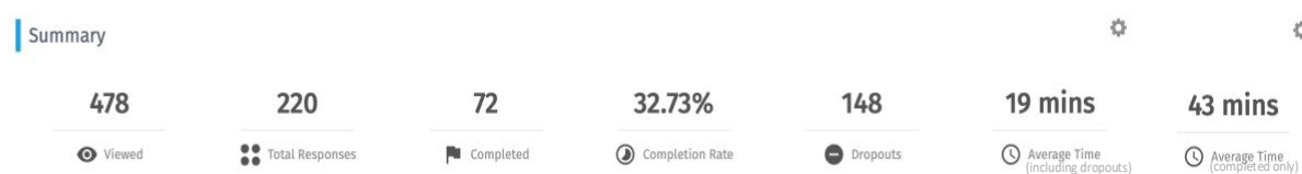
Figure 2 Summary of experts' responses to the questionnaire.