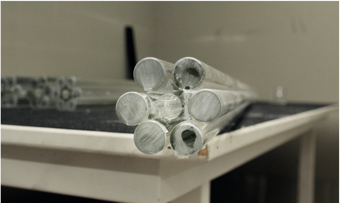
Rod configuration of the final bundled column design.