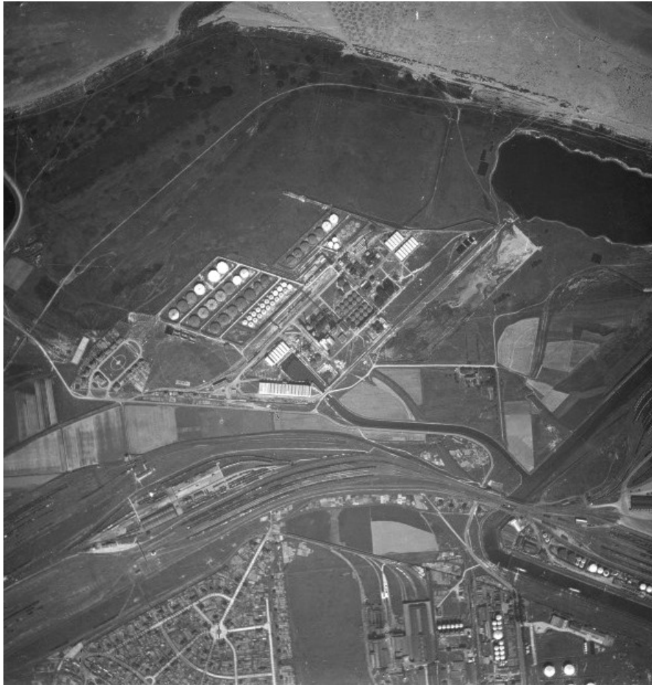
Figure 2. Aerial picture of the refinery Petrofina France, in 1936, later called refinery BP for British Petroleum, the company owning the facility. The Cité des Ingénieurs is on the southwest territory of the refining complex.

industrial port cities with the creation of spaces between port and city territories that served as buffer zones. None of the previous disasters linked to oil pushed public and private actors to prevent its construction. Similar developments happened in other parts of the world, like in Iran with the oil city of Abadan (Hein & Sedighi, 2016). In Abadan, the oil-led developments and industrial borders went beyond the obvious spatial division to incorporate social ranks and status in the design of cities' districts. For instance, Abadan's oil refinery—located in Abadan near the coast of the Persian Gulf—was completed in 1912 and, until it was bombed and destroyed in 1980 by the Iran–Iraq war, remained one of the world's largest refineries which is part of the current Oil Museum of Abadan (Mehan & Behzadfar, 2018). Borders were not only multiple and discriminating but also porous with the oil facility at the center of the district and the houses of the oil company's employees around it.