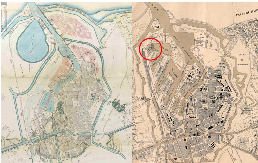
Figure 1. Maps of the port city of Dunkirk. On the left, Dunkirk in 1875, and on the right in 1910 after the modifications of the Freycinet Plan. The red circle highlights the location of the floating dam and the basin dedicated to oil, the furthest away from the city center.

The improvements in the relation between urban planning of port-cities and the settlements of industrial sites kept, however, on being linked to dreadful events. Public and private authorities did not immediately move industrial sites storing and transforming oil