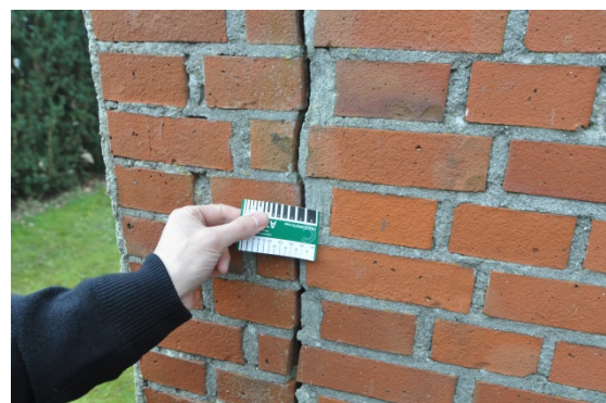
Figure 1: Damage inspection of masonry house in Groningen

buildings have strip foundations. They are prone to damage such as cracks.