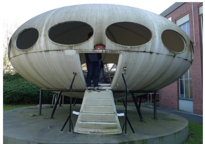
04 The Munich-Futuro in Witten (Germany) before transportation to Munich.

only few have been restored. 3 All Futuros compared here were designed and produced in the late 1960s and had periods of progressive deterioration, related to relocation and changed ownerships. Most of them were dismantled and reassembled several times, exposed to different environmental conditions and used for different functions. These events explain different types and levels of deterioration to their glass-reinforced plastic (GRP) shells, which required different intervention approaches.