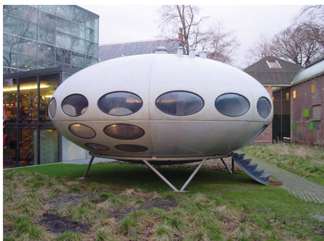
01 Futuro No. 000 (prototype) before conservation in 2003 exhibited outside in the Centraal Museum in Utrecht.

An informal survey carried out in preparation of this paper showed that out of more than 100 Futuros there are about 60 left worldwide today [Voigt, Pamela, "The Futuro – History, Design and Construction in Finland and the USA" Docomomo Journal 66: 2022/1, p. 40-49]. Some have been relocated and dismantled, but