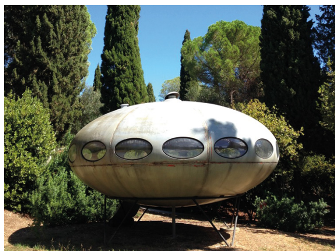
02 The Corfu-Futuro house installed in Limni, Corfu island.