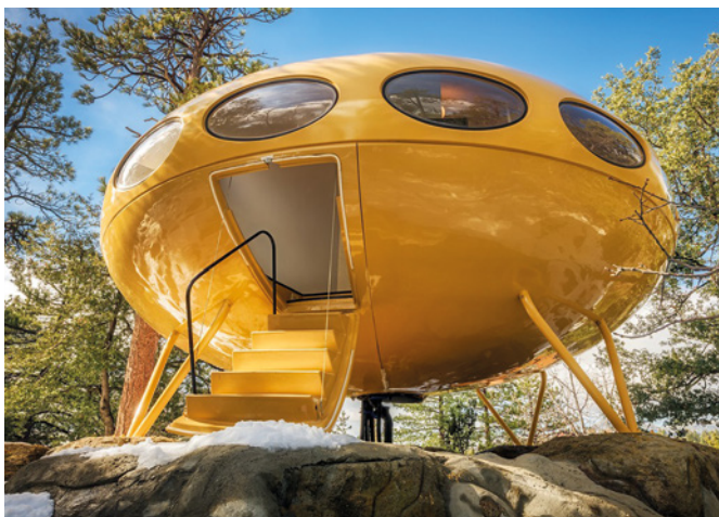
03 The Donaldson-Futuro is placed outside and serves as a private guest house.