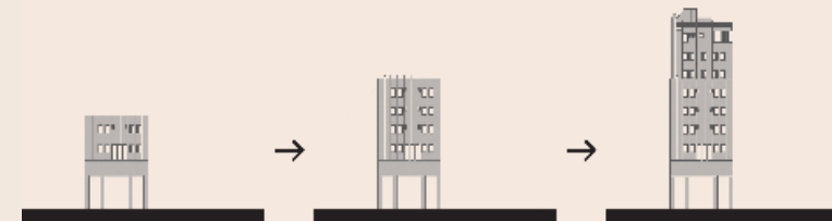
Figure 4. One possibility for enabling the option to expand the number of floors of the buildings.

The text on pages 86-89 of this volume is an adapted version of a journal article that extensively explains the framework and the Vlissingen case study: Anvarifar, F., Zevenbergen, C., Thissen, W., & Islam, T. (2016). Understanding flexibility for multifunctional flood defences: a conceptual framework. Journal of Water and Climate Change, 7(3), 467-484.