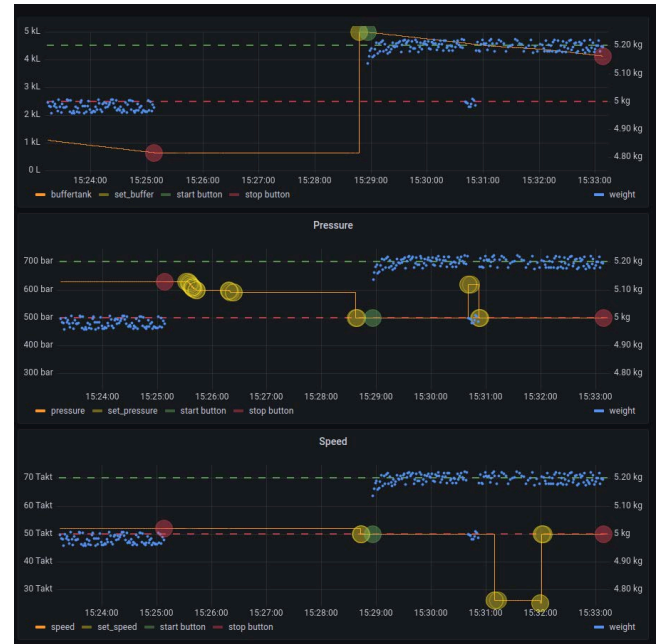
Figure 2: Visualizing simulated shop floor data enables workers to review parameter adjustments and assess their impact on the production line. The circles indicate different types of user interactions (e.g., changing a parameter) and the blue dots indicate the weights of individual canisters of detergent

As discussed in the background section, several challenges must be overcome to successfully deploy an Intelligent Agent for self-reflection and knowledge sharing in a factory. These challenges include user acceptance; privacy; limits to human memory and self-awareness; the risk of capturing bad practices and; handling dynamically changing knowledge. The aspects related to user acceptance can be broken down into perceived benefits, perceived ease