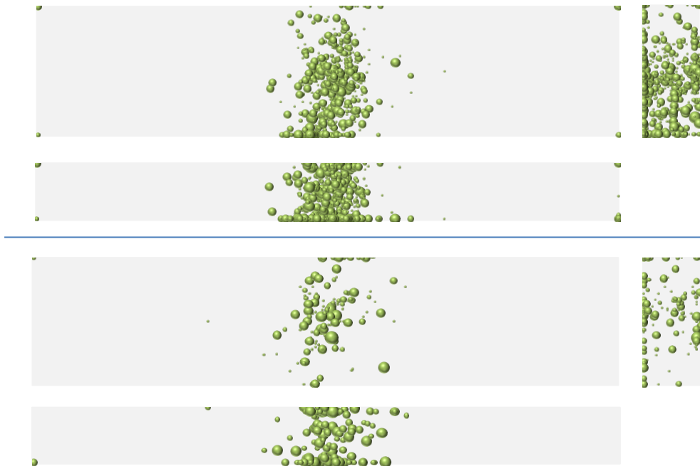
Figure 2: Acoustic emission activity recorded before (top) and after (bottom) healing of the specimen shown in fig. 1 [1]

and so on. Optimization of the captured frequency range should also allow proving crack healing irrespective the type of used healing agent and the sample's size.