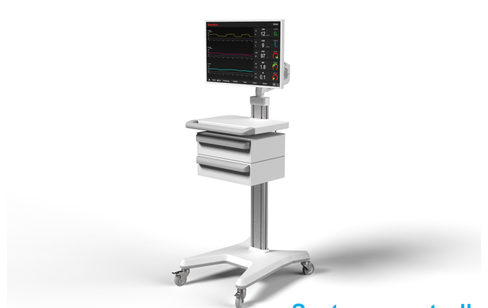
System on a trolley