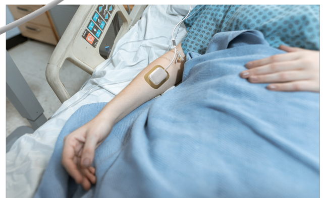
Optimised for ICU