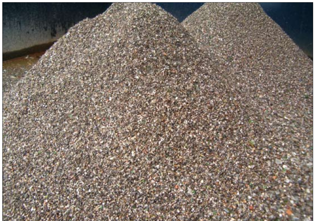
Fine granules for use in limesandstone, asphalt and cement.

The wet eddy current separator is only one apparatus in the entire bottom ash processing chain. There is also a density separator – another example of elementary physics and mechanical engineering ingenuity. When you place a piece of copper and a piece of aluminum in a bucket of water at the same time, the copper sinks to the bottom first. Copper is heavier than aluminum and therefore sinks faster. So much for the elementary physics. The question now is: how to design a machine that can exploit this fact to separate copper and aluminum. In a laboratory experiment, Peter Rem figured out how to separate a single batch. He placed a mixture of light and heavy particles in the water. In order to observe the effect well, these two fractions were of different colors. As soon as the heavier fraction had sunk to the bottom, a sort of luxaflex formed above it. The lighter fraction then collected on the luxaflex. Extremely ingenious, very simple, but unsuitable for a continuous supply of material.