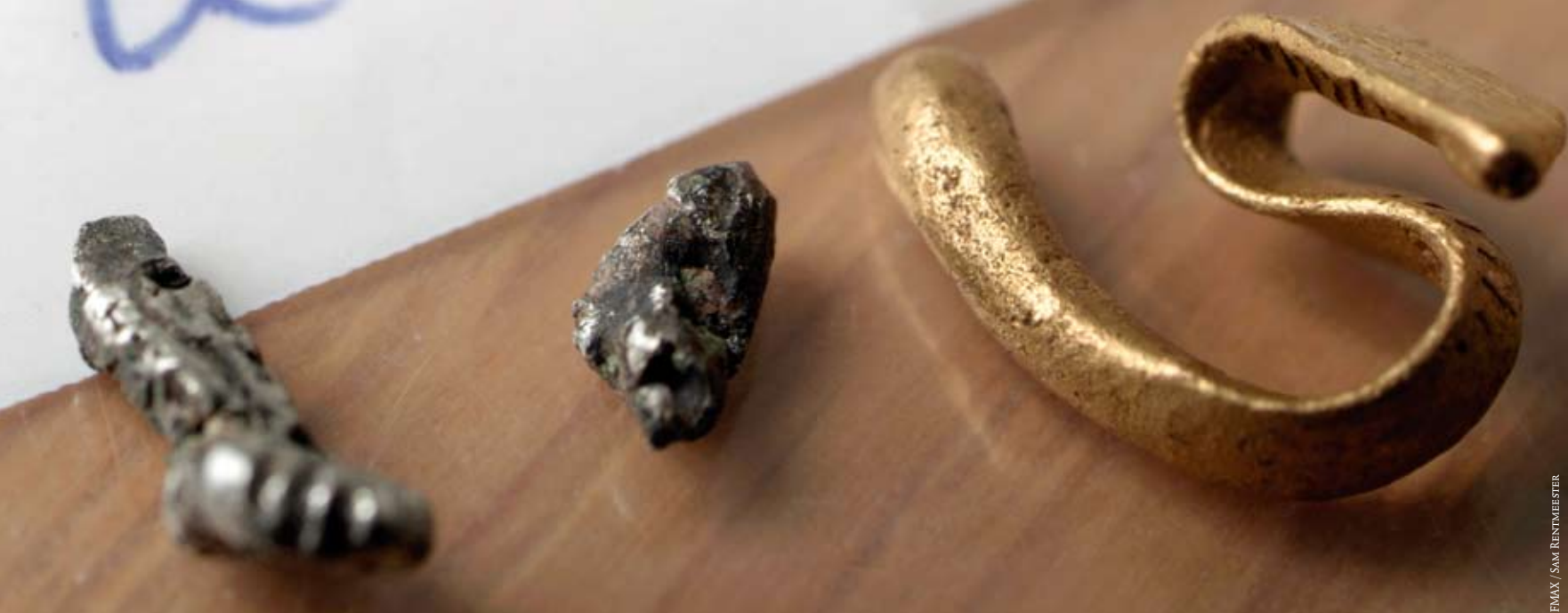
EMAX / SAM RENTMEESTER

Delft technology reclaims valuable metals from incinerated domestic waste in an amsterdam test factory