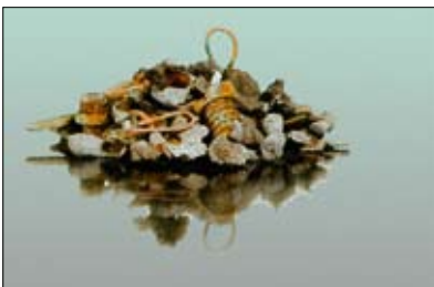
AFVAL ENERGIE BEDRIJF, AMSTERDAM SOURCES: 2005 AEB ANNUAL REPORT

The bottom ash that remains after the waste has been processed is in fact a new type of waste and, as such, presents a problem. Solution: AEB transforms the bottom ash into building material by removing the metal particles from the remaining ash. In partnership with TU Delft, an effective process for this has been developed: wet non-ferro separation of bottom ash. AEB and TU Delft have registered three international patents for this technological process.