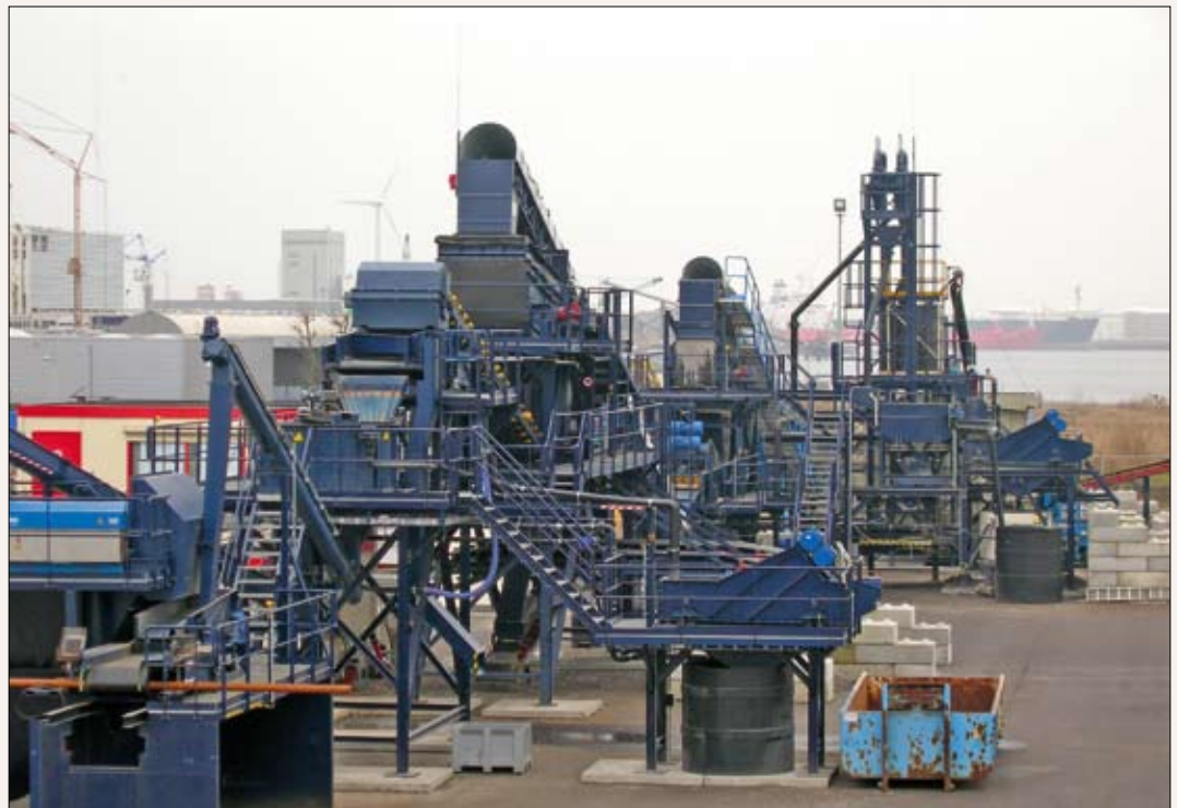
The pilot factory on the grounds of the municipal Afval Energie Bedrijf (AEB) in Amsterdam's harbor area.

can also present problems. Much of the aluminum in domestic waste is in the form of aluminum foil, which is difficult to separate. Incineration however melts the aluminum foil down to fine, pure drops of aluminum, which is easy to separate.