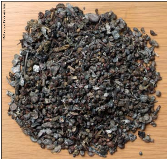
Fijne metaaldeeltjes uit huishoudelijk afval: smelt van zware non-ferro fractie uit bodemas

Rem therefore devised a separator that converted the difference in time into a difference in distance. This separator consisted of a cylindrical vat, in which a turbine revolved around a central axis. The blades created compartments that could be extracted as individual batches. The blade revolved slowly, which allowed the compartments behind to be filled with material that entered the separator at a fixed point. When looked at from above, the cylinder resembled the face of a clock, with each compartment being filled at 12 o'clock. The heavier fraction in the compartment sunk faster than the lighter fraction. The circulation speed was so consistent that the heavier fraction reached the bottom at 6 o'clock, the lighter fraction at 9 o'clock. The heavy and light fractions were removed at the 6 o'clock and 9 o'clock outlets, respectively. And at 12 o'clock the compartments were filled again for the following round. Thus, a very refined, continuous separation occurs based on density.