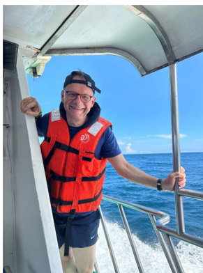
On a boat trip to Turtle Island, Taiwan (July 2023).