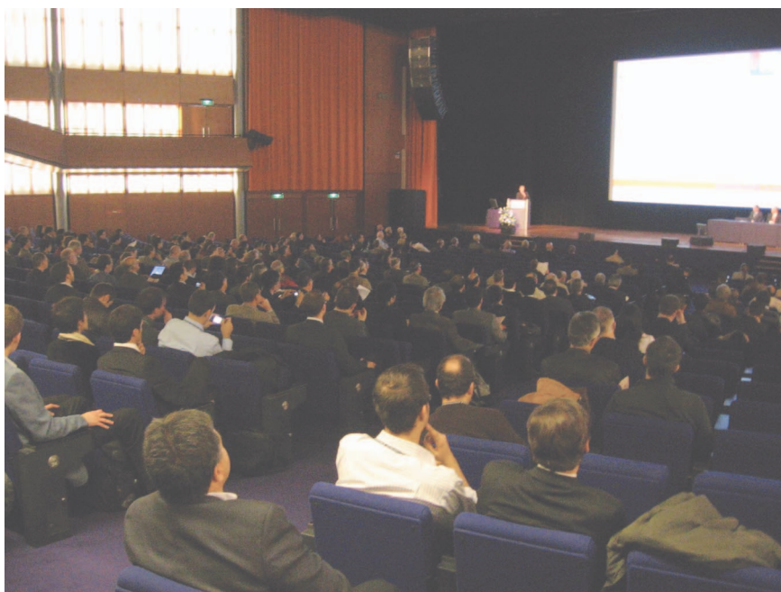
The well-attended EuMW 2008 grand opening session in the RAI auditorium.