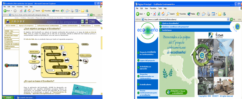
Figure 1: Ecodesign Manuals based upon the PROMISE approach in the North of Spain and in Central America available on-line.

Most of the above mentioned manuals are online available like for example the two Spanish version of IHOBE and CEGESTI (see figure 1). The web-site addresses of the online available manuals can be found in the reference list.