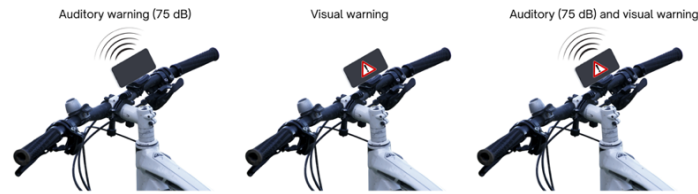
Figure 2: The auditory, visual, and visual-auditory warning system features of CycleSafe

or the on-vehicle eHMI. In line with previous research, the auditory signal will be 75 dB [8, 9]. For the visual signal, we will use a warning triangle symbol flashing on the screen twice for a duration of 400 ms, followed by a 400 ms break and 2400 ms visibility, similar to Erdei et al. [9]. The eHMI will be illuminated in cyan colour, indicating automation is on. The eHMI will light up green for the yielding trials, referencing that of a traffic light (see Figure 1). Early warnings will be issued before the cyclist can differentiate the yielding and non-yielding trials. As CycleSafe and the eHMI are still at the concept stage, the warnings will be triggered by GPS at pre-determined location points decided through pilot testing. The cyclist will interact with the vehicle in 20 trials and perform each combination twice, adding up to 40 trials per participant. All conditions will be randomised in blocks, starting with the baseline condition, e.g., the cyclist will receive a late and early warning to a vehicle yielding and not yielding in a randomised order for one randomised HMI modality at a time.