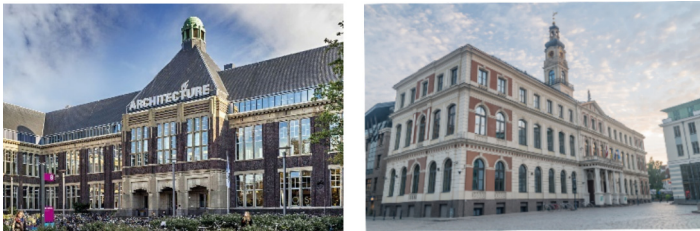
Fig. 1. Case studies front view (Left: Delft, Right: Riga).

The Riga City Hall is the administrative building of the Riga Municipality, located in the Historic Centre of Riga (Fig. 1). The area of intervention has three floors, with around 30 desks of office workers. The occupancy patterns follow mostly fixed schedules. Heating control is primarily manual with thermostatic valves. Cooling systems operate with basic on/off control, and there is no interlock to prevent simultaneous heating and cooling. The lighting relies on manual switches, and the building envelope, including window shading and operation, is manually controlled. The building has a glazing facade orientated towards the south, providing views of the City and the Daugava River.