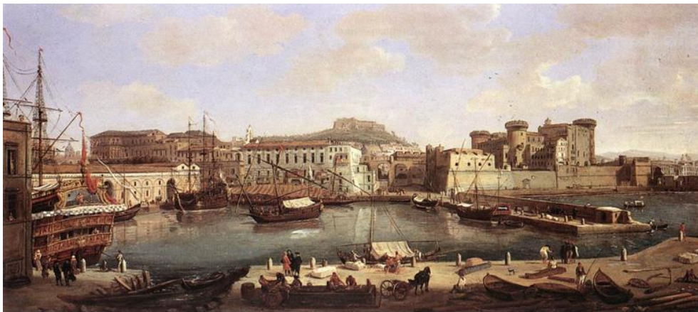
Fig. 3 – Port of Naples, 1700-1710

Source: Caspar Van Wittel. Wikimedia Commons