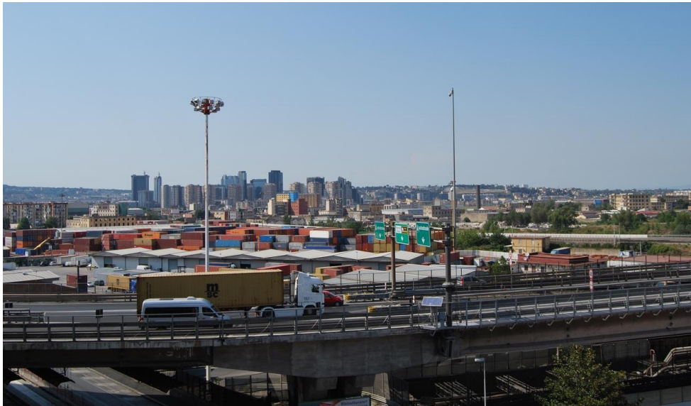
Fig. 1 – East Naples, 2017

The contrast between port expansions and urban development has always characterised the coastal landscapes of many European port cities and beyond (Bruttomesso, 1993; Desfor et al. , 2010; Hein, 2011). It is in this liminal space, between the port and the city that spatial conflicts materialize because of a lively political friction between the infrastructural plans of the port authority and the urban policies of municipal institutions. Divergent goals and approaches of leading actors produce conflicts and deadlocks that turn spatially into physical borders, sectoral areas and social enclaves (Fig. 1). As a result, in many port cities, the areas where port and city physically meet have become a collage of disconnected pieces from a social, environmental, functional and economic point of view.