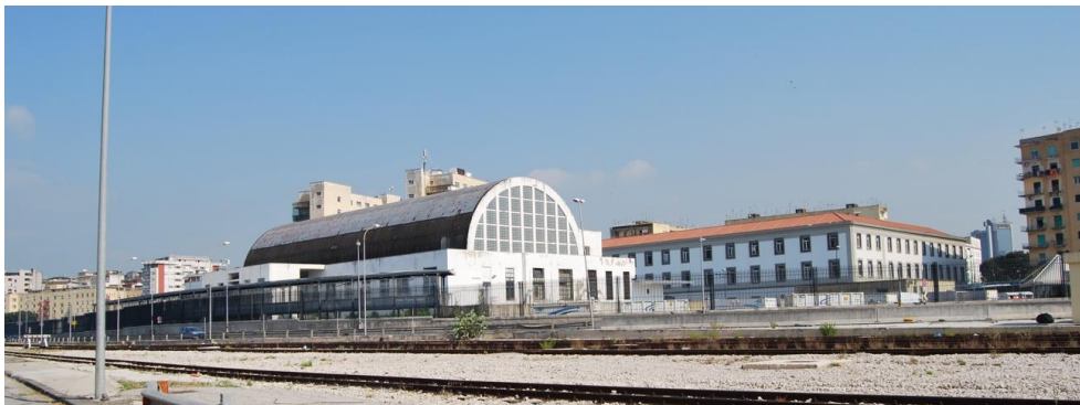
Fig. 7 – Mercato Ittico, 2016

In the port city landscape, different elements contribute in framing the image of the port city as it is perceived by people and, thus, as it should be preserved. The role of industrial buildings and docks in the regeneration of urban waterfronts defines a well-known approach that finds its principles in the acknowledgment of the port building environment as part of urban heritage (Bruttomesso, 1999). As testified by international cases (Meyer, 1999; Schubert, 2008; Hein, 2011, Porfyriou and Sepe, 2017), strategies based on reusing port buildings and areas imply that port activities and infrastructures move in peripheral areas, leaving the urban shoreline. This is not the case of Naples.