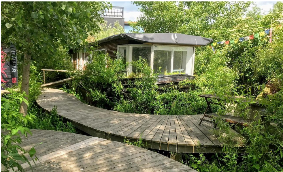
Fig. 5 – De Ceuvel, Amsterdam 2017