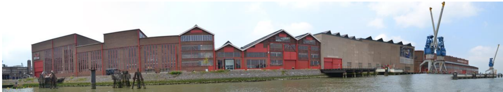
Fig. 4 – RDM Campus, Rotterdam 2017