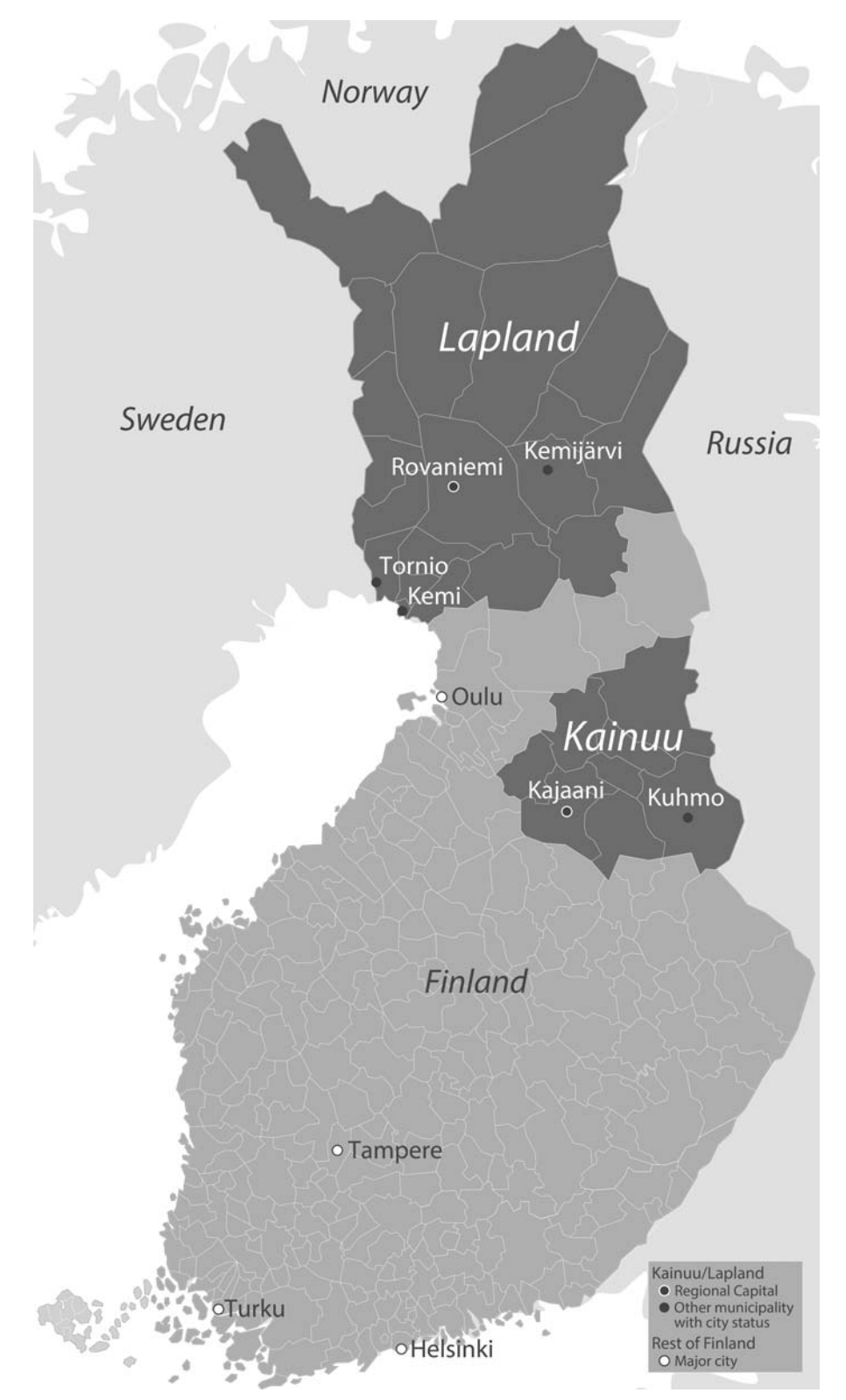
Figure 1. Lapland and Kainuu, and the regional capitals and other municipalities with city status in the two regions, viewed in the context of major cities in Finland.