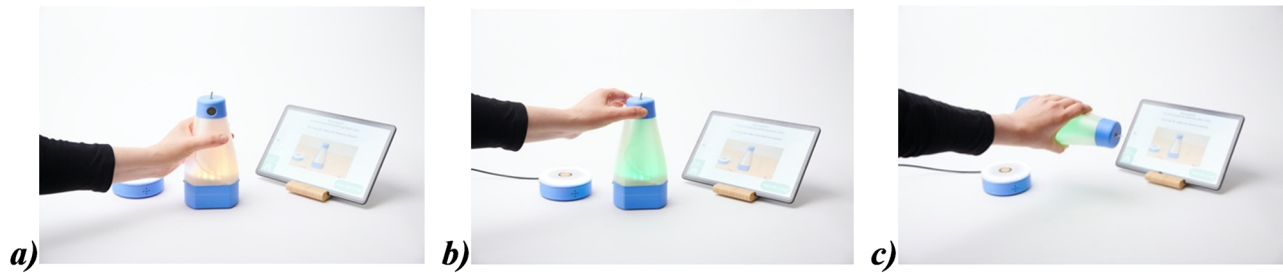
Figure 1. The interactive demonstrator “EDO” and the three exercises included in the interface: (a) cylinder grasp, (b) pinch grasp, and (c) lifting and tilting movement.