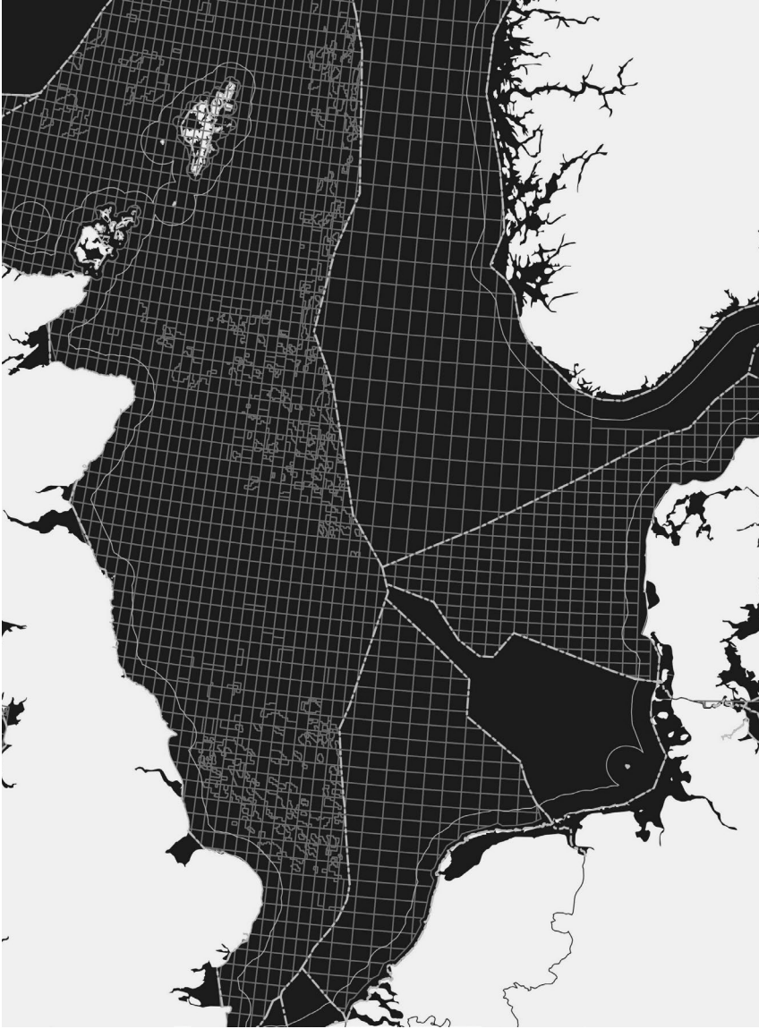
Fig. 2 The North Sea petroleum grid (Couling)

is reflected in the industry's logistical spaces. Constantly “swapping assets” and reconfiguring ownership constellations, the industry is also made up of numerous operators delivering specific services and has therefore mostly been able to avoid public liability. The largest oil spill in the history of the offshore industry, the 2010 Deepwater Horizon disaster in the Gulf of Mexico, is a tragic illustration of this point. (9) Given the previously mentioned relationship between energy consumption and material prosperity, it comes as no surprise that the objectives of this industry resonate with neoliberal practices in business and politics more generally, even though the UN led countries into the Paris Agreement concerning CO 2 emissions.