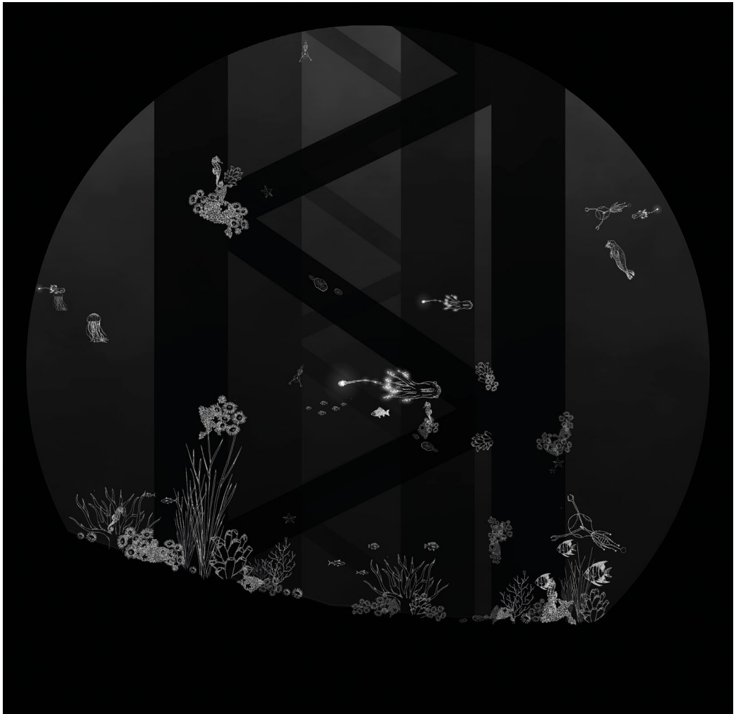
Fig. 3 Video still "The Swarm." Little archaeological and data-controller robots operate in intelligent seasonal swarms, working together to monitor the health and cultural value of the North Sea. (Justine Sleurs, Bergen School of Architecture BAS 2019)

Kipnis's new architecture proposed large mute volumes formed by incongruous, unfamiliar geometries that set up unexpected relations to their surroundings and therefore enhanced the heterogeneity of the resulting spaces. We argue that considering oceanic water masses as vast, deep volumes rather than flattened planes can stimulate architectural thinking along the lines Kipnis intends. In addition to volume, they possess cores and density, properties normally associated with solids. While still unfamiliar to architects, these organic geometries are precisely determined according to the oceanographic parameters of depth, currents, bathymetry, temperature, and salinity.