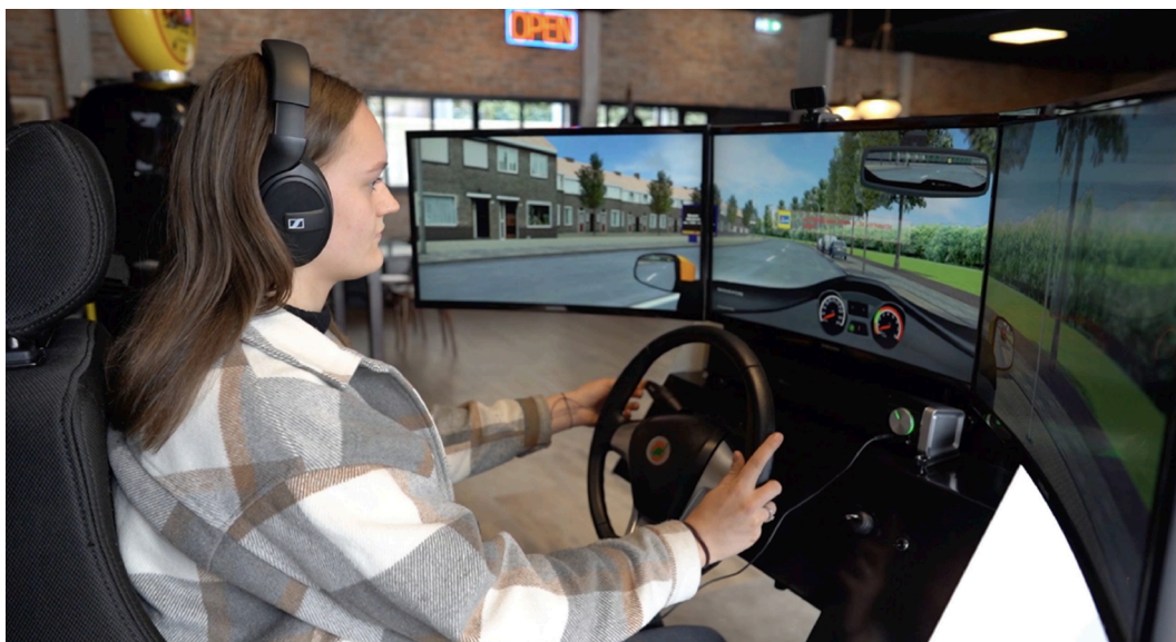
Fig. 1. Driving simulator type “Drive Master B”.