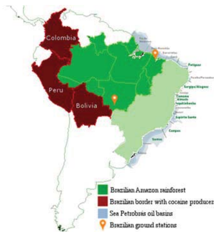
Figure 1: Brazilian scenarios information based on Petrobrás (2007), Gagne (2017) and DPI (2017).

Figure 1 provides an idea of the location and area extension of the scenarios described above, and the positions of the Brazilian ground stations as well.