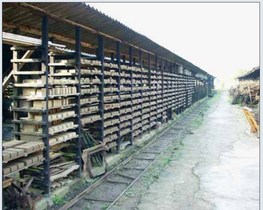
The unfired bricks are left to dry to the atmosphere for several days.