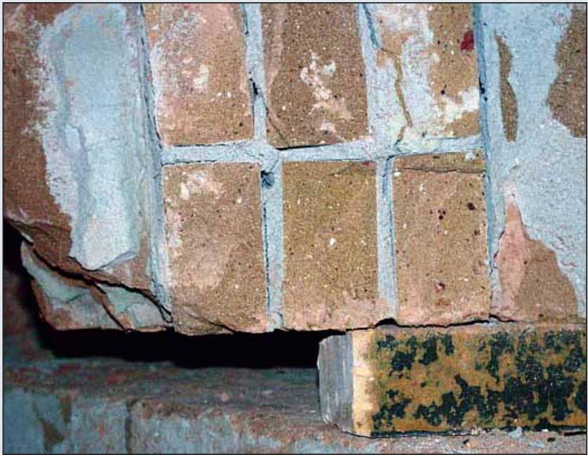
The cracks at the brick/mortar interface are the result of the difference in linear expansion coefficient.