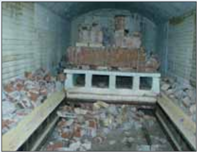
In three hours, the rubble was heated to a temperature of 540 °C. After two hours at that temperature, the cooling stage followed. The bricks, which had been stacked high inside the kiln, had broken apart from the mortar and tumbled from the kiln lorry.