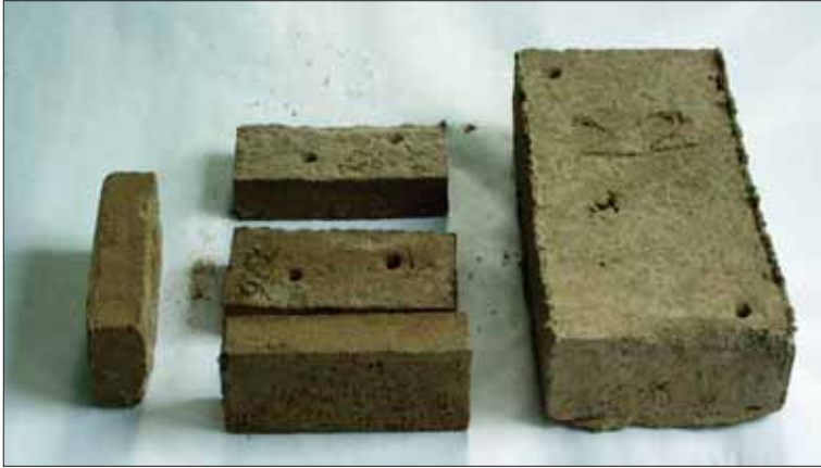
To prevent the 'green' bricks breaking during the internal transport at the factory, they must be sufficiently dried.