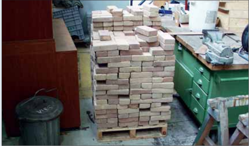
The newly fired fifty/fifty bricks containing 50% brick granulate and 50% clay.