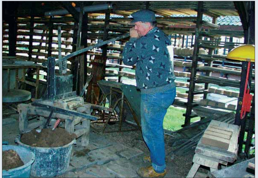
At the Kijfwaard brickworks at Pannerden, a test was conducted in which the brick fraction, after being ground, was mixed with clay in a 50/50 mix. Using the common Dutch production method with moulds (because of the soft clay), the mixture can be used to produce bricks. The clay mass is pressed into moulds that have been sanded to make the unfired bricks easier to extract.

“The linchpin is formed by the recycling companies that process rubble into road construction granulate. For the time being, this remains a lucrative business, witness the number of recycling plants that have seen the light of day since 1995. They get paid both to take in debris from the demolishers, and to supply granulate. But the time is nigh when the demand for road construction granulate will decline as fewer new roads are being built, and the concrete industry ‘demands’ the concrete rubble fraction. This will open the road to recycling of bricks, and will even turn it into necessity.”