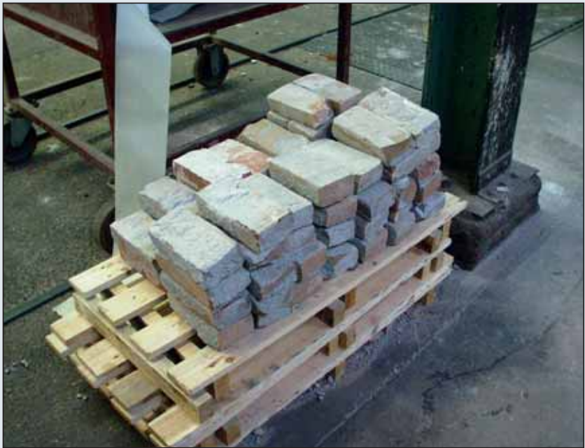
By reclaiming the retro bricks, the recycling loop has been successfully closed. It is now up to the industry to apply the method in the field.