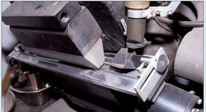
The residual fraction, which consists of broken and damaged bricks and mortar, can be separated into pure fractions of bricks and mortar by means of magnetic separation so research at the Applied Earth Sciences faculty has shown. This is made possible by the fact that the brick particles contain about 3-5% iron, while the mortar particles contain less than 0.5%.