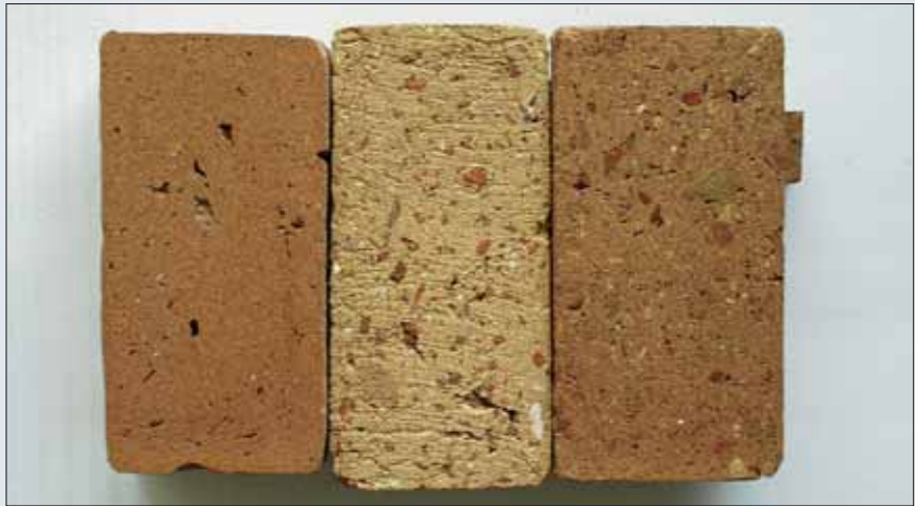
From left to right: the reference brick (pure clay), the fifty/fifty brick containing 50% masonry granulate, and the fifty-fifty brick with 50% brick granulate.

The surface assumes the colour of the fired clay, whereas the sections show brick particles of different colours. The sections have been injected with resin to produce strong polished samples that can be viewed through a microscope.