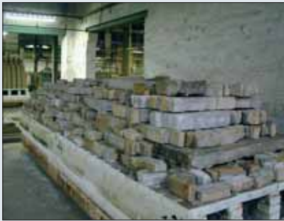
To recycle the masonry rubble, a thermal process was developed by TU Delft in collaboration with TNO to extract the bricks from the masonry rubble. The masonry was subjected to a heat treatment in the chamber kilns of the Terca window lintel factory at Reuver, Limburg, in the south of the Netherlands.

Subtle demolition 🦋 The thermal method for reclaiming bricks is advantageous from an energy point of view. Also, it requires less energy than is required to fire new bricks (see separate box). The drawback is that the breakers, the recycling companies, have to ensure that parts of walls are retrieved in one piece from a demolition site. After all, subtle demolition is a contradiction in terms. Before the process can be applied in the real world, research will have to be done into developing a new approach to demolishing buildings, according to Dr. Peter Rem of the Raw Materials Technology section at the faculty of Applied Earth Sciences. Rem specialises in the deployment of tested and tried separation techniques from the mining industry for new applications. He thinks it is not such a bad idea to heat a building in its entirety.