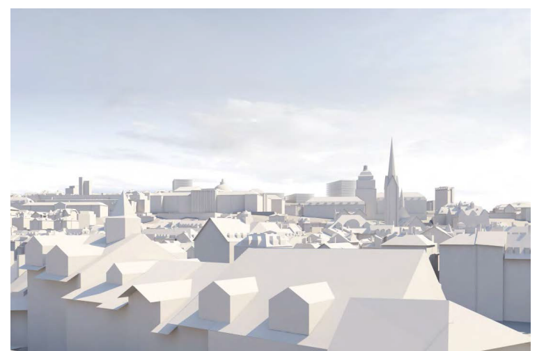
Figure 3. View of the design project developed by Team Gigon / Guyer, in the design competition in 2015

A master plan approved in September 2014 (EBP, 2014) provides a first outline for renovating the structural and operational infrastructures of the site over the next 30 years. For the city of Zurich, the area represents not only one of the most challenging tasks in the near future but is also supposed to serve as an incubator and demonstrator for a new inclusive planning process that connects the relevant actors and leverages synergies. Due to its complexity, integration of spatial development, energy planning and mobility is crucial for the success of the transformation in the end.