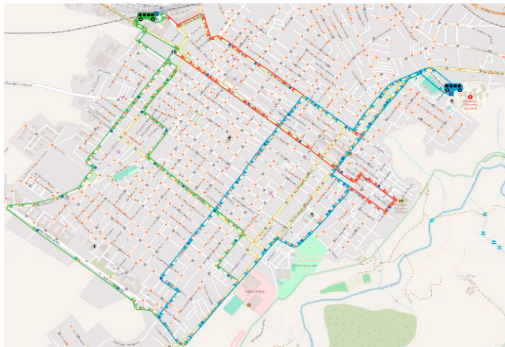
Fig. 1. Representation of the three FRT lines and the road network used for the DRT service, where the virtual stops are shown as grey dots. The terminal of the green and red lines is the intermodal station, while the terminal of the blue line is the city hospital.

The case study is Vittoria, a small-sized city in the south of Italy. The study area, including the urbanized area ( \sim 8.40 \text{ km}^2 ), consists of 33400 inhabitants, with a residential density of about 4000 residents per square kilometre. The intermodal station of Vittoria is located on the city outskirts, acting as railway station and extra-urban bus terminal. Currently, private cars account for most of the trips. The municipality is planning a new urban PT network (which is absent at the time), consisting of the 3 lines depicted in Fig. 1.