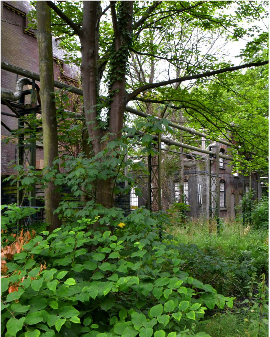
figure 1, contrast between nature and industrial buildings at the Hembrug site