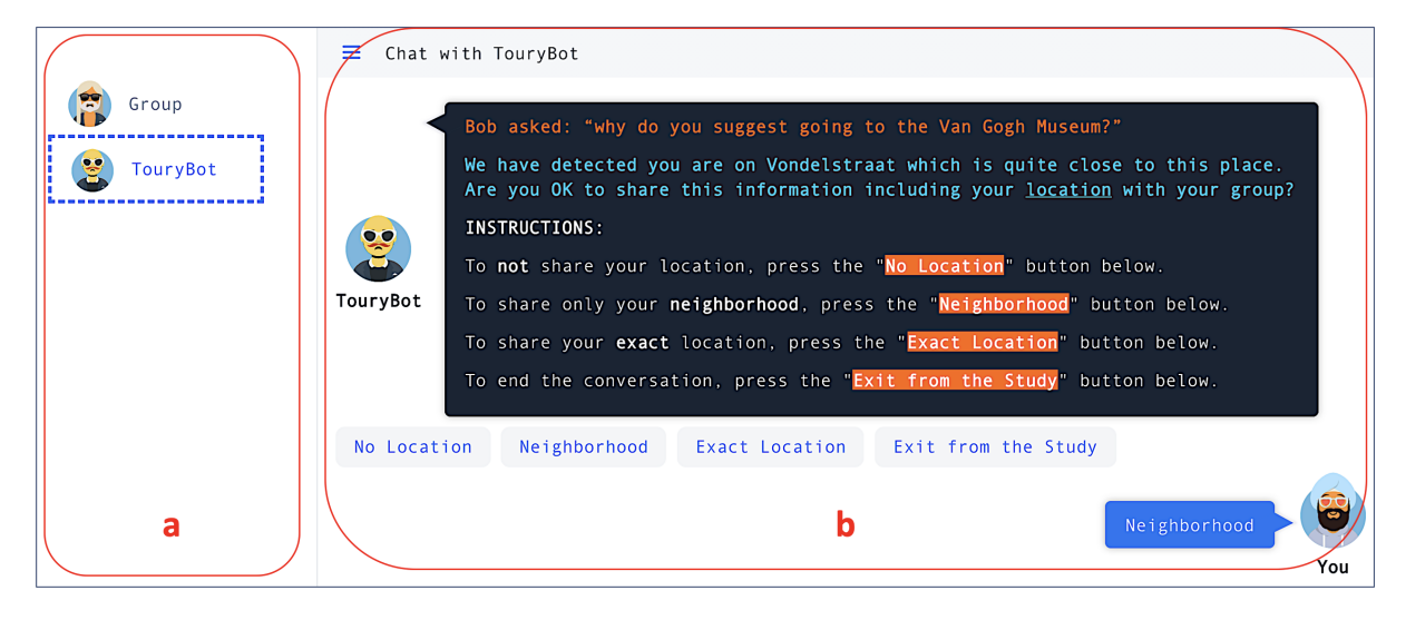
Figure 2: The chat in the majority preference scenario between the chat-bot and an active user. a) indicates two ongoing chats, one with a chat-bot and the group, b) indicates an ongoing chat with a chat-bot. Here the user can indicate the level of location information they want to share to convince the other group member (Bob) to visit the suggested POI.

3.3.2 Initial POIs. For the user study, we needed POIs for both the minority and majority preference scenarios. To collect such POIs, we provided participants with ten initial POIs to rate on a 5-point Likert scale (ranging from "definitely would not visit" to "definitely would visit"). The ten initial POIs retrieved from the most frequently visited POIs in the city of Amsterdam from the social location service Foursquare.<sup>3</sup> By using participants' real preferences, we aimed to increase the likelihood of a more realistic situation for users to imagine.