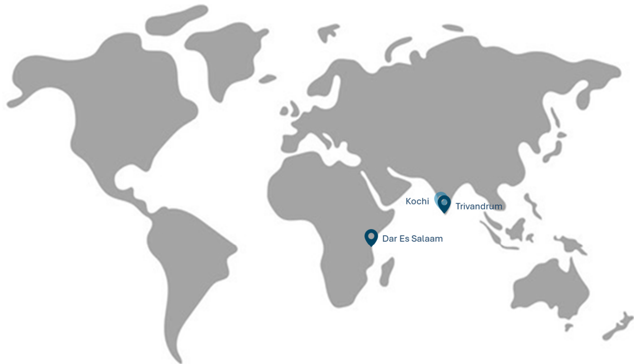
Figure 1. Case study locations.

called the 20,000 Plots Project (see Figure 1). In each country, these programs are compared with local-level community-led housing projects: in India, the implementation of BSUP by Kudumbashree—a charitable society governed by the local authorities—in the cities of Kochi and Trivandrum, in the state of Kerala; and, in Tanzania, a community-led resettlement project undertaken by the Chamazi Housing Cooperative in Dar es Salaam.