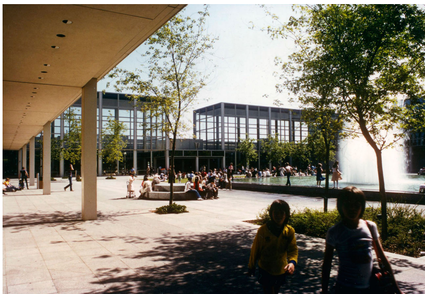
Figure 2. Image of the Queen's Court, inside the shopping centre.