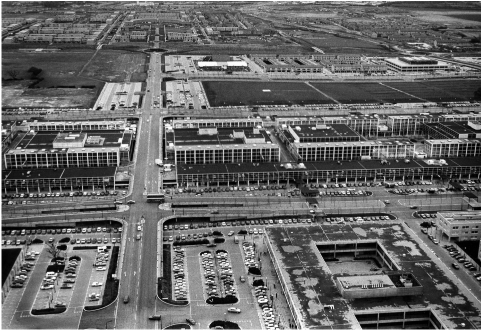
Figure 7. Aerial view of Milton Keynes' shopping centre, showing how the elevated road provides access to the service roads on top of the building.