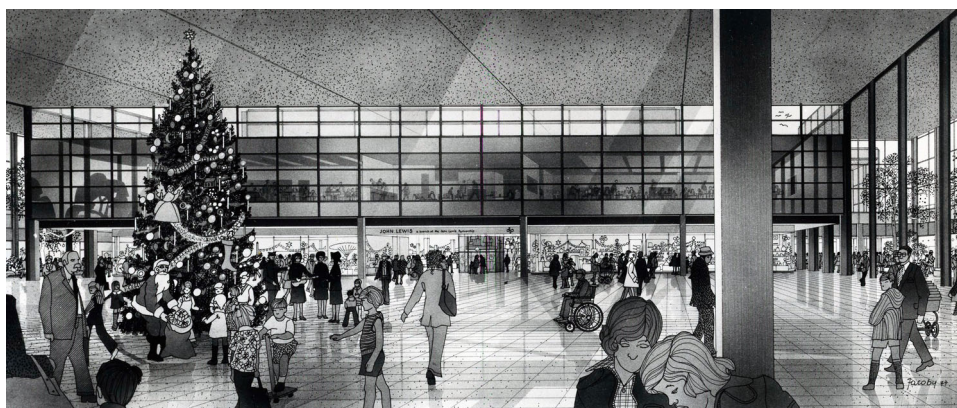
Figure 3. Architectural drawing of Middleton Hall by Helmut Jacoby, 1974.

inculcate the right kind of civic pride ...'. 33 Like many of his contemporaries – local councillors, professional planners, architects, designers and even developers and builders – who highly valued civic pride as an aspiration for urban development and as a symbolic form of power, 34 Walker, together with Mossdrop and Woodward, consciously wrought to translate these aspirations into