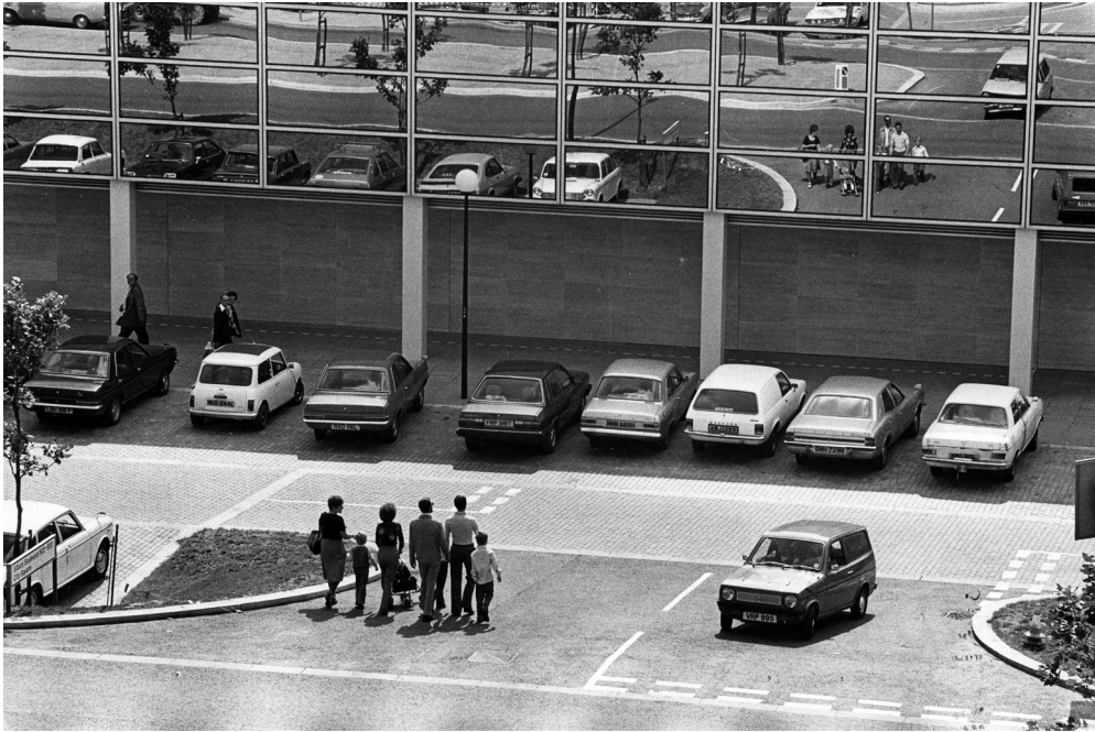
Figure 9. Exterior view of Milton Keynes' shopping centre, showing the mirror glass panels applied to the façade.