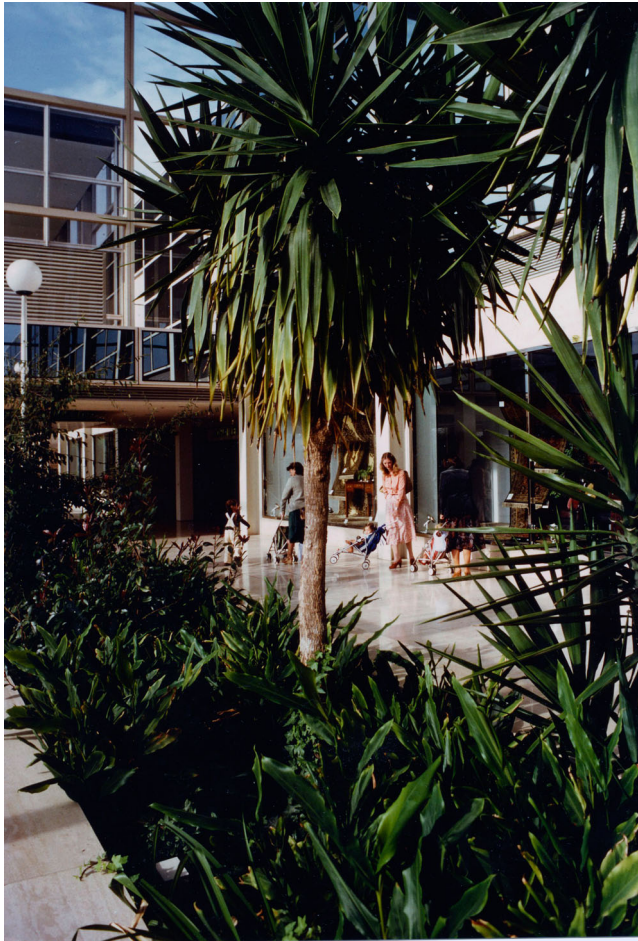
Figure 4. Interior view of one of the main arcades of Milton Keynes' shopping centre, showing its lush vegetation in the foreground.