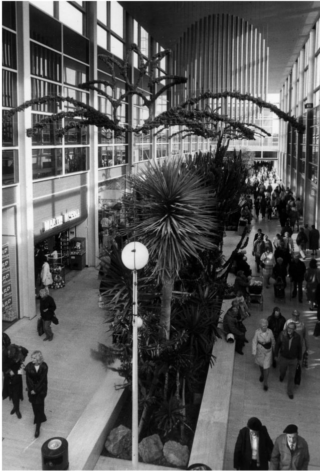
Figure 6. View of the ‘Circle of Light’ sculpture by Liliane Lijn inside Milton Keynes’ shopping centre.