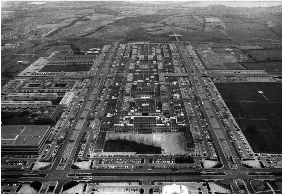
Figure 8. Aerial view of Milton Keynes' shopping centre shortly after completion.