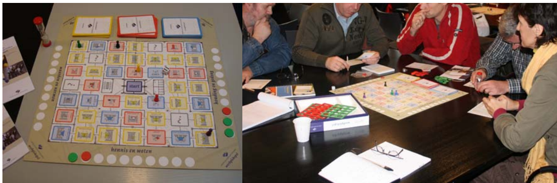
Figure 1: The Workplace Game

The Workplace Game is a board game which includes a game board, six pawns, six pencils, one dice, a 3-minute hourglass, answer cards, a booklet with the rules of the game, a guide for possible supervisors, and playing cards (figure 1). It is presented in a box that includes all materials needed to play the game. The game board has been designed to resemble an office floor plan. It has different rectangles or rooms, in accordance to the three colours of the playing cards. Three sides of the board show a series of circles where small red (implying the group did not reach consensus) and green (implying the group did reach consensus) coloured discs can be placed, representing the three themes. The starting point is in the middle of the board in a square representing the elevator shaft. A special type of rectangle holds a question mark. One might notice that the game board has a function in the game, but is not essential. It is possible to play the game, just using the playing cards. The explanation for making it a board game is that the board serves as a 'focal point'. Also, it provides immediate feedback during the game on the game results, presenting for instance the red and green discs for consensus amongst the players.