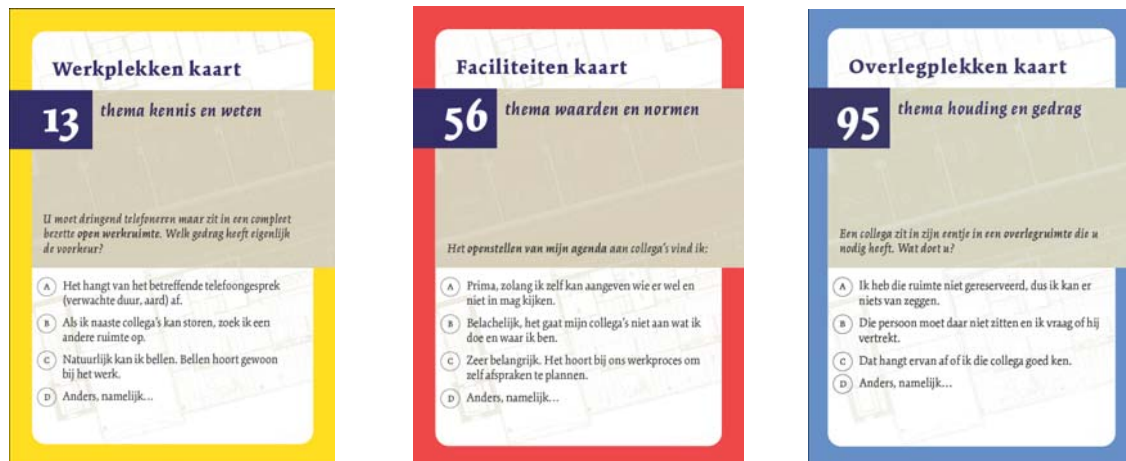
Figure 2: Examples of the Situation Cards

In order to correlate the game with the actual and specific office situation a pre-selection of the game cards is required. Only half the cards (36) are selected and used. This selection is based on the two times three categories as previously discussed. Cards should be selected in such a manner so as to ensure the same number of cards in every category. Every player is also given a response card to write down their own answer and the answer of the group. Figure 2 shows some examples of the different situation cards.