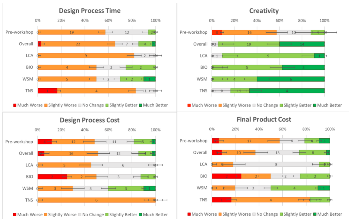
Figure 2. Shift in perceptions across design methods (1)