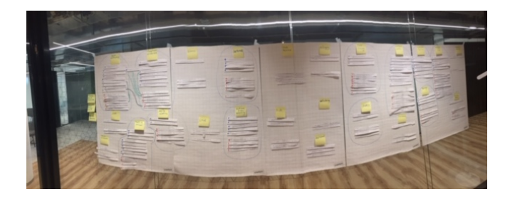
Figure 2: Analysis of ING 2019 and MS 2014 questions.

Table sorted on the percentage difference in the number of questions in the ING study compared to the Microsoft study.