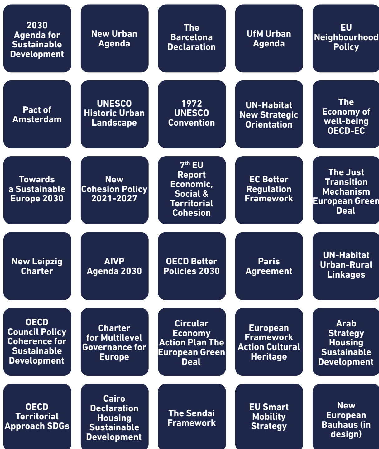
Figure 1: Main policy frameworks used in the elaboration of this Action Plan.