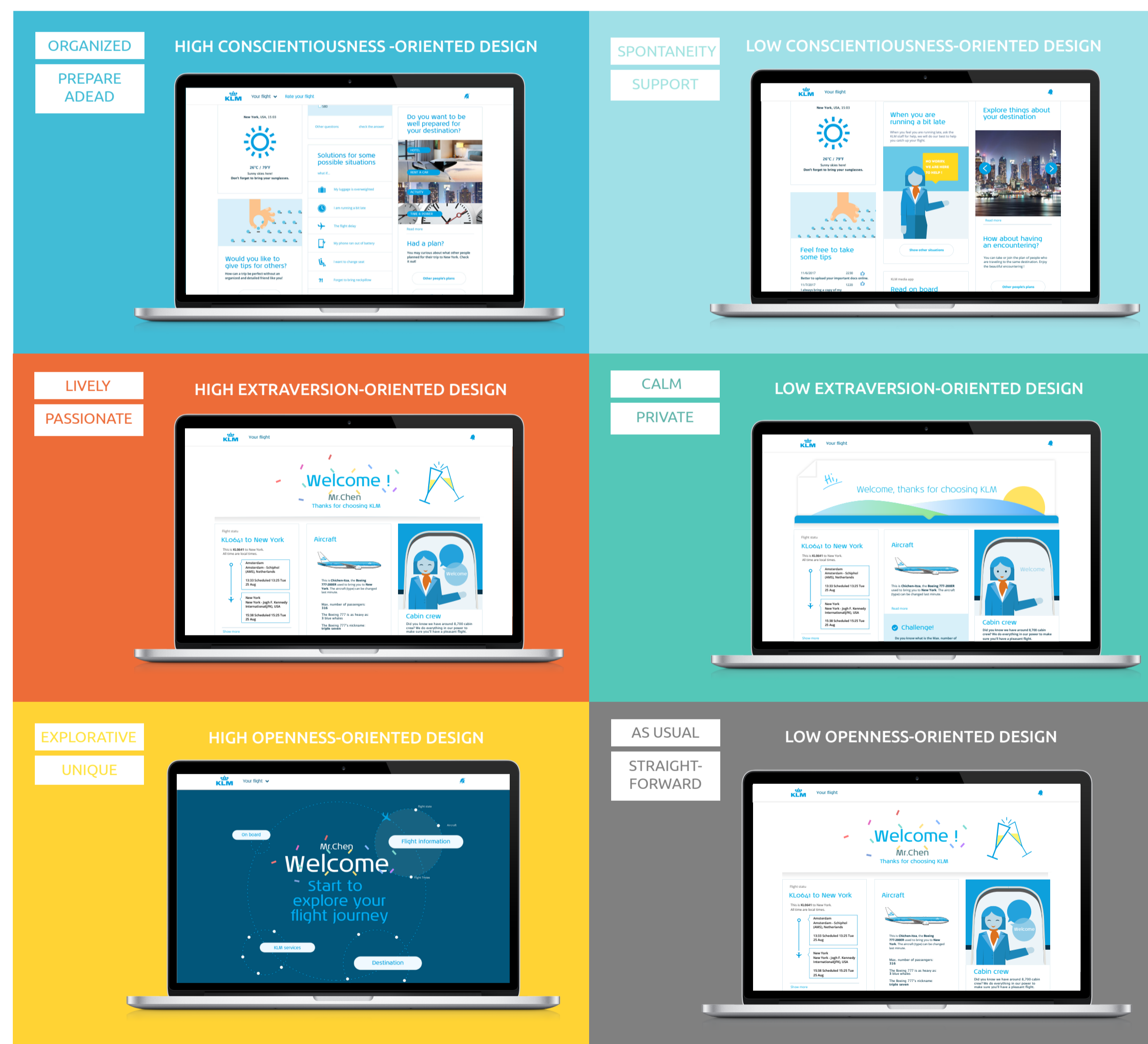
Figure 2. The Flightguide tailored by personality

Building on the evaluation results, services taking personality into account by applying the proposed principle can positively influence customer experience.