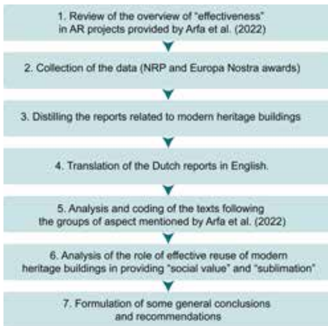
Figure 2. The procedure of conducting the research. Own illustration.

The methodology used in this research has been adapted from the research conducted by Arfa et al. 9 with some amendments and it is outlined in Figure 2 . The NRP and Europa-Nostra awards have been selected due to being among the most well-known awards for AR at the European and Dutch levels and having access to their jury reports.