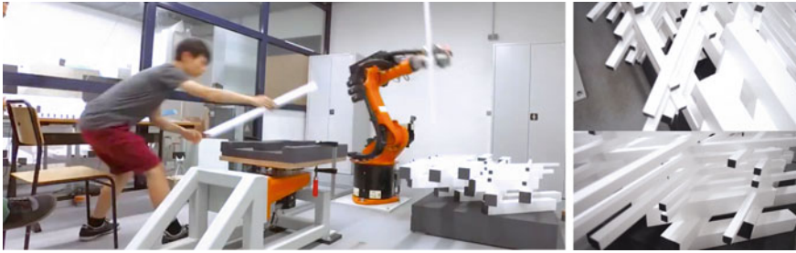
Fig. 1.1 Human-assisted robotic assembly of non-uniform linear elements implemented with PhD and MSc students

Considering the 50% of tasks that cannot be completely automated, robots will not replace humans but rather support them by taking over repetitive and/or heavy tasks. The human role will be mainly focused on envisioning new forms of physical environments and advancing novel means for their construction and operation as well as supervising and intervening when the non-human agents require assistance. This implies that cyber-physical systems integrated into buildings and building processes will increasingly share agency in the use of means of production and space.